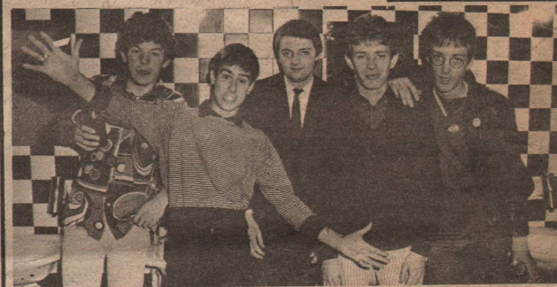
Brighton boys Piranhas — netting the UK.

Half Moon, Herne Hill (19); Notre Dame, Leicester Square (21); Cascade Club, Shrewsbury (23); Hull University (24); Sheffield University (Ranmore House) (30); Queen Mary College, Mile End (31); The Crown Inn, Eastleigh (Feb 2); University of London (8); Art College, Brighton (9).