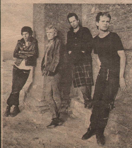
UK SUBS get the blues...

THE Dickies' new single, 'Fan Mail' is released this week on the A&M label. Available as from January 25, the single is taken from the group's latest album, 'Dawn Of The Dickies' and will be pressed in special red vinyl in a picture sleeve.