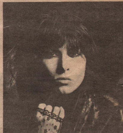
Chrissie Hynde — 30 dates!

Following the massive UK tour, the group plan to embark on their debut American tour.