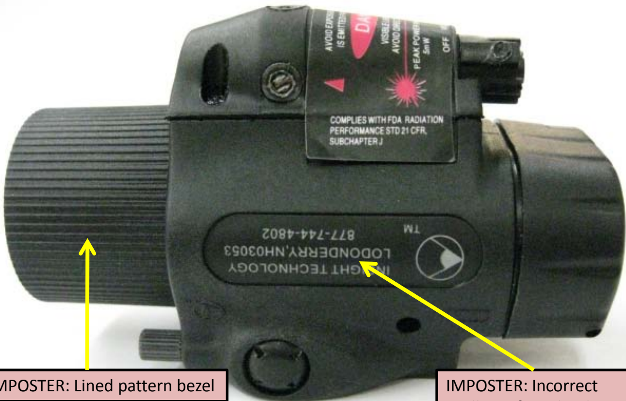
IMPOSTER: Lined pattern bezel