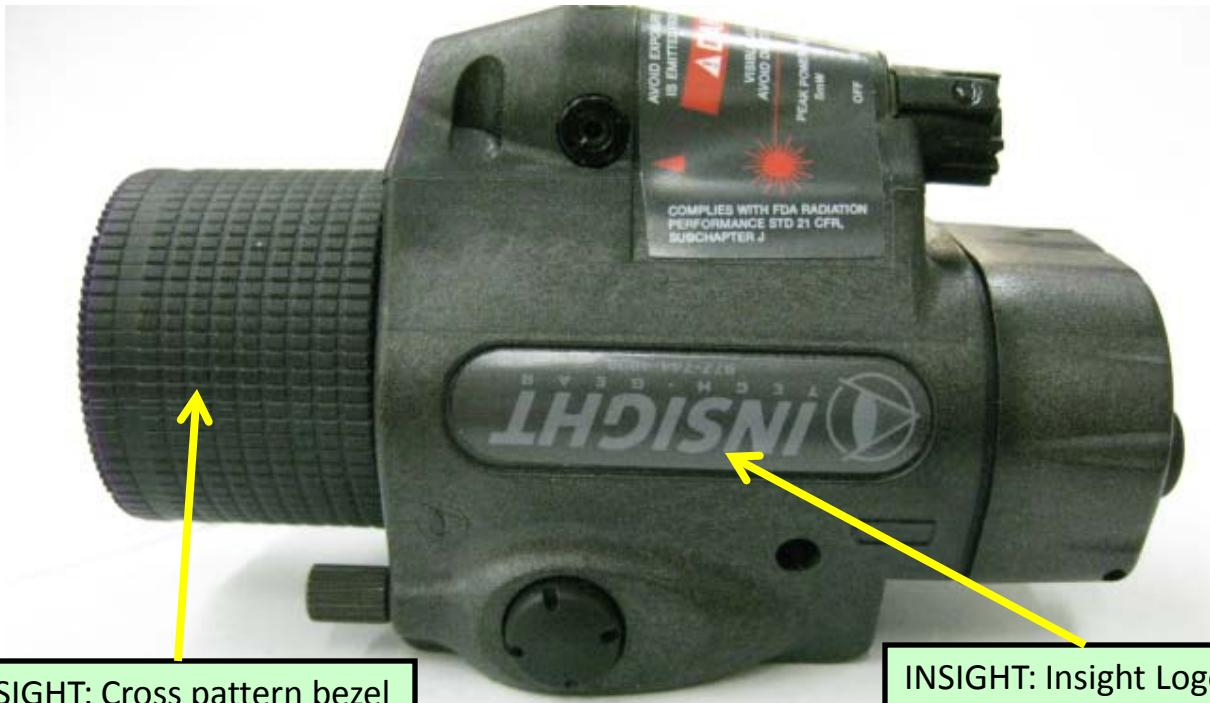
INSIGHT: Cross pattern bezel