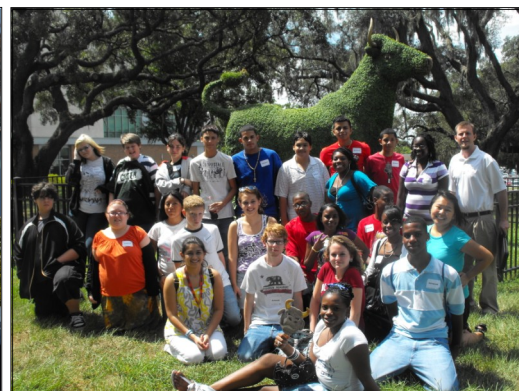
9th Grade AVID class at USF