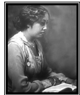
Ms. Blanche Armwood

~ considered an early 20th-century Renaissance woman who steadfastly held the values of hard work, religious morality, and judicial equality before the American consciousness?