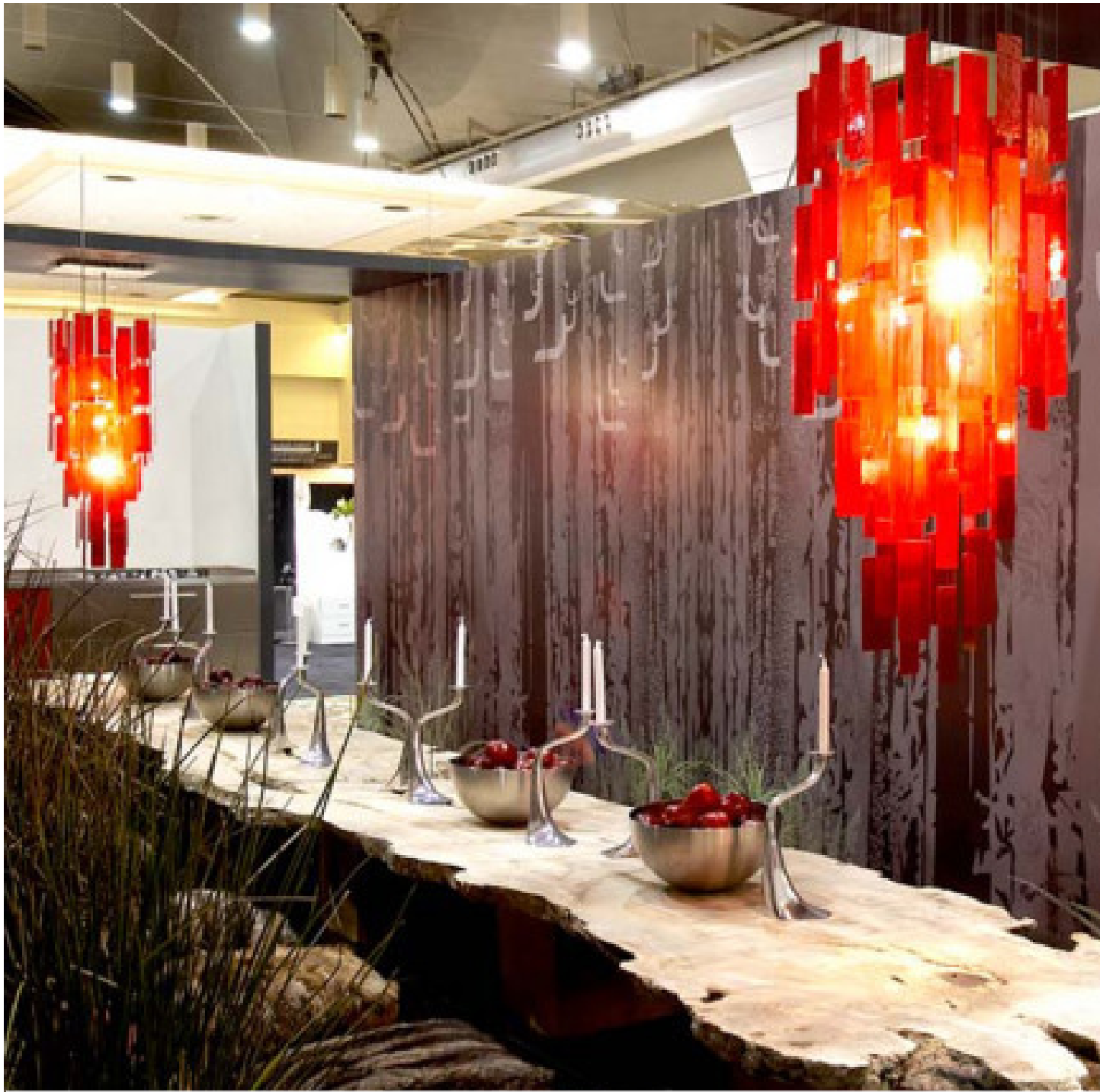
RWDV exhibition by Cause+Effect.

For example, recently we branded Modo, the car co-op. Great organization, bad brand. Therefore little influence, and for an organization that has strong values and advocacy, this was unfortunate. Now they have a strong brand, good organization, more influence. Bigger change. L: Since the rebranding, have they seen business go up? S: Yup. 40 per cent. L: Wow. Congratulations that's amazing.