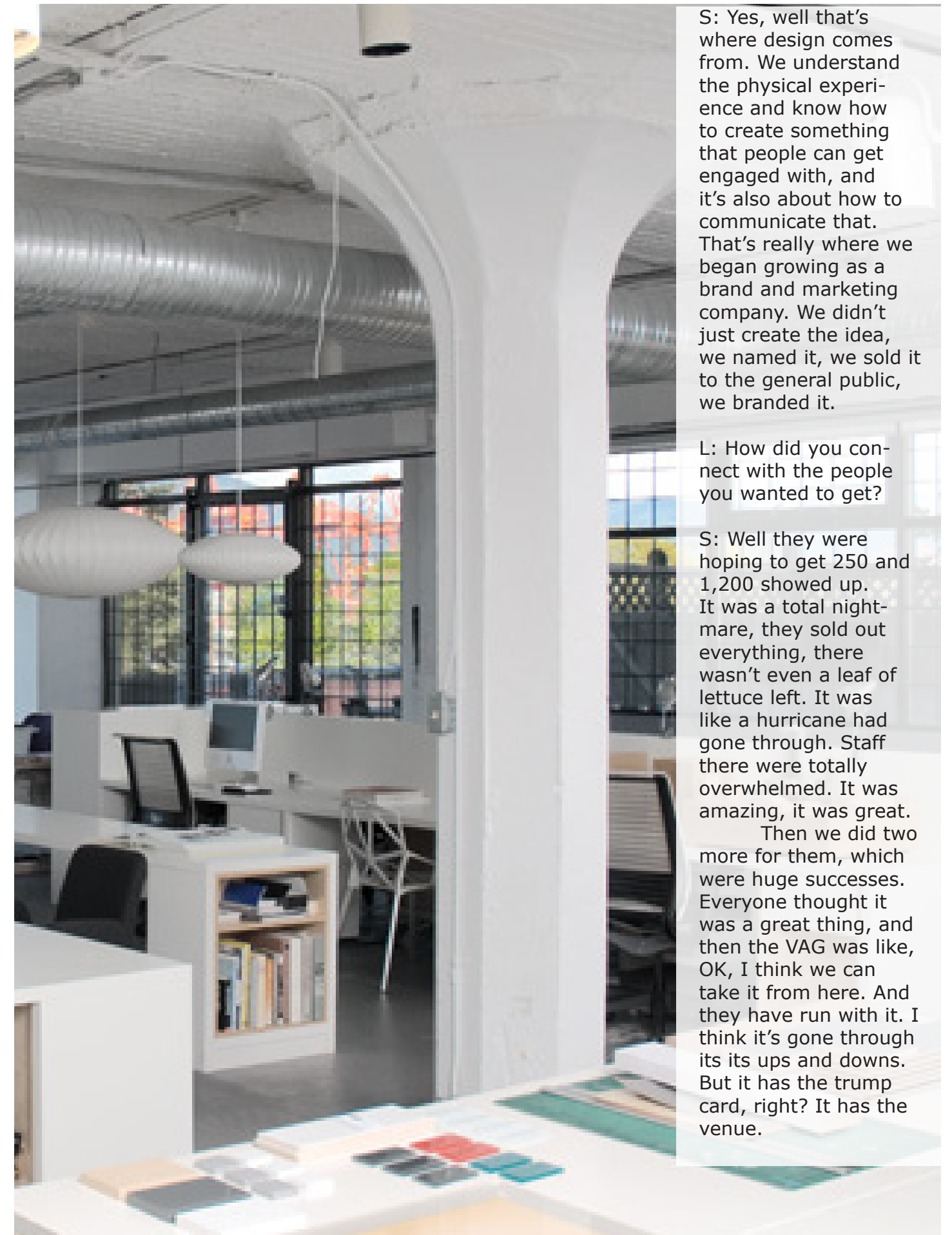
Cause+Effect office space