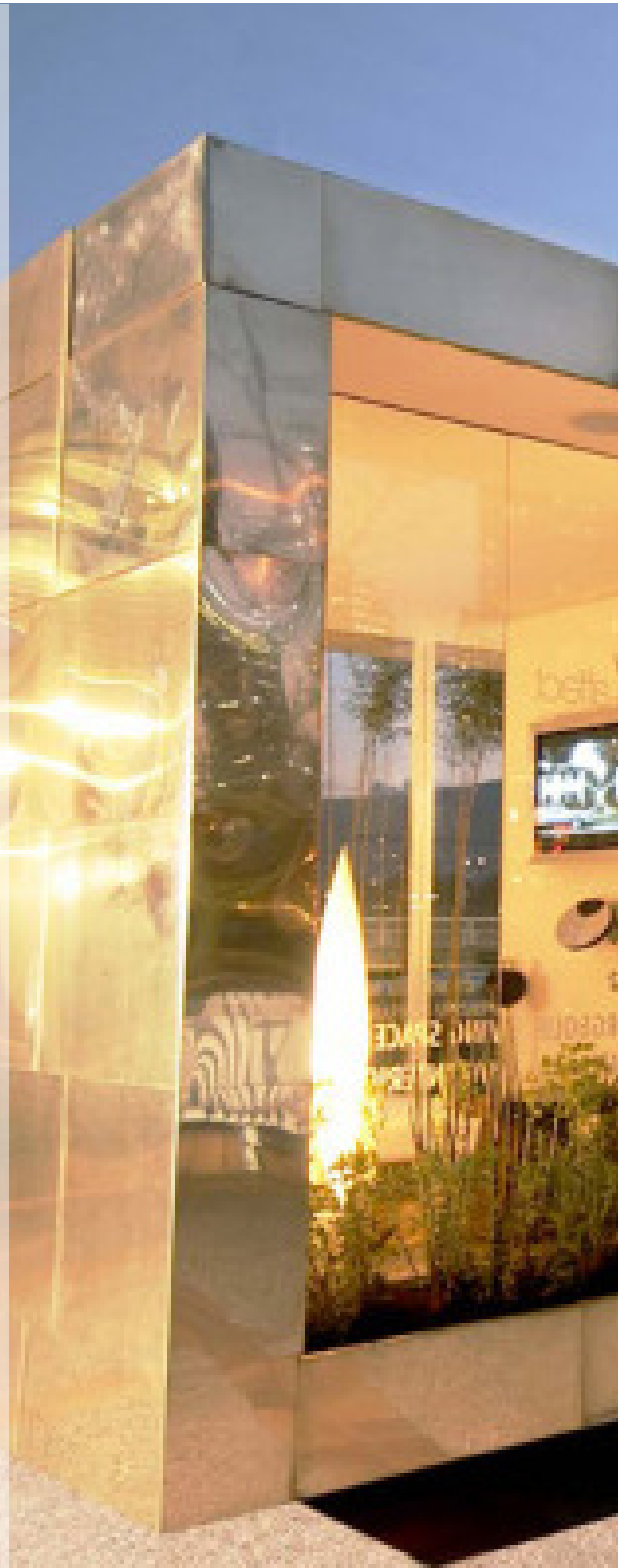
Concept Condo

S: It was a couple years until Pecha Kucha happened.