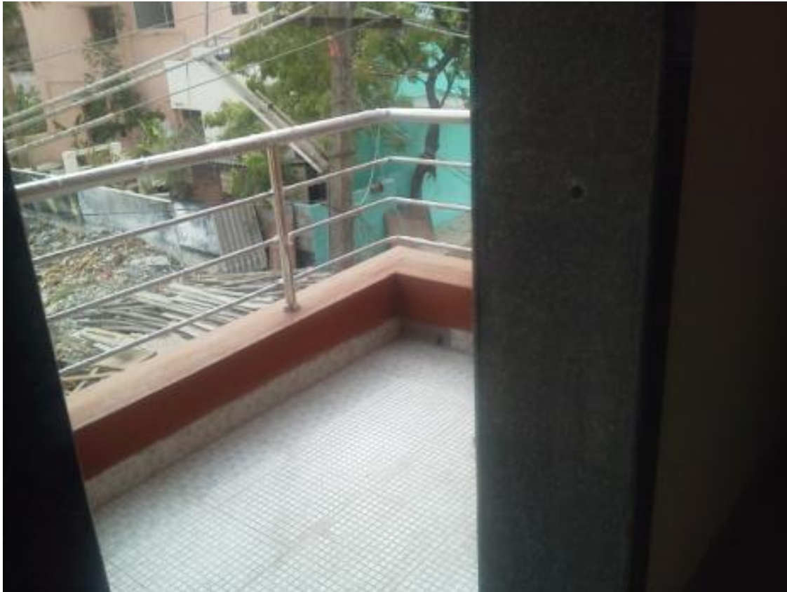
BALCONY IN MASTER BED ROOM