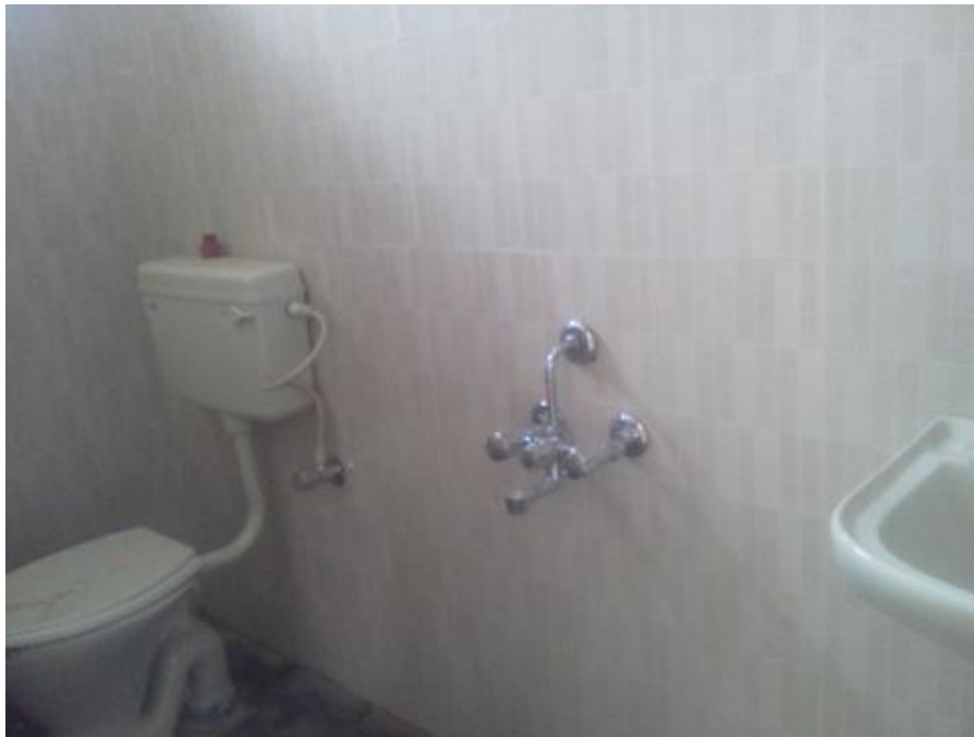
REST ROOM IN BOTH THE BED ROOM