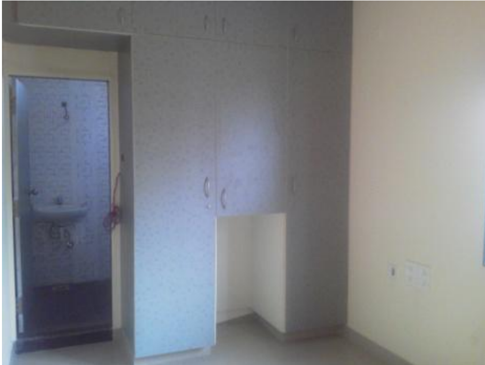
WARDROBE IN CHILDRENS ROOM (BED ROOM-2)