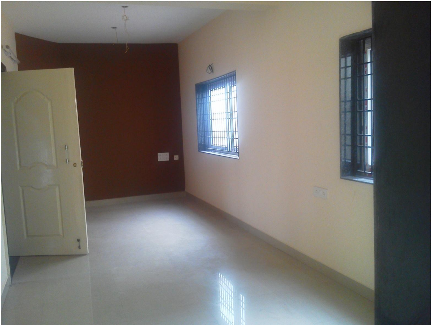
LIVING CUM DINING HALL