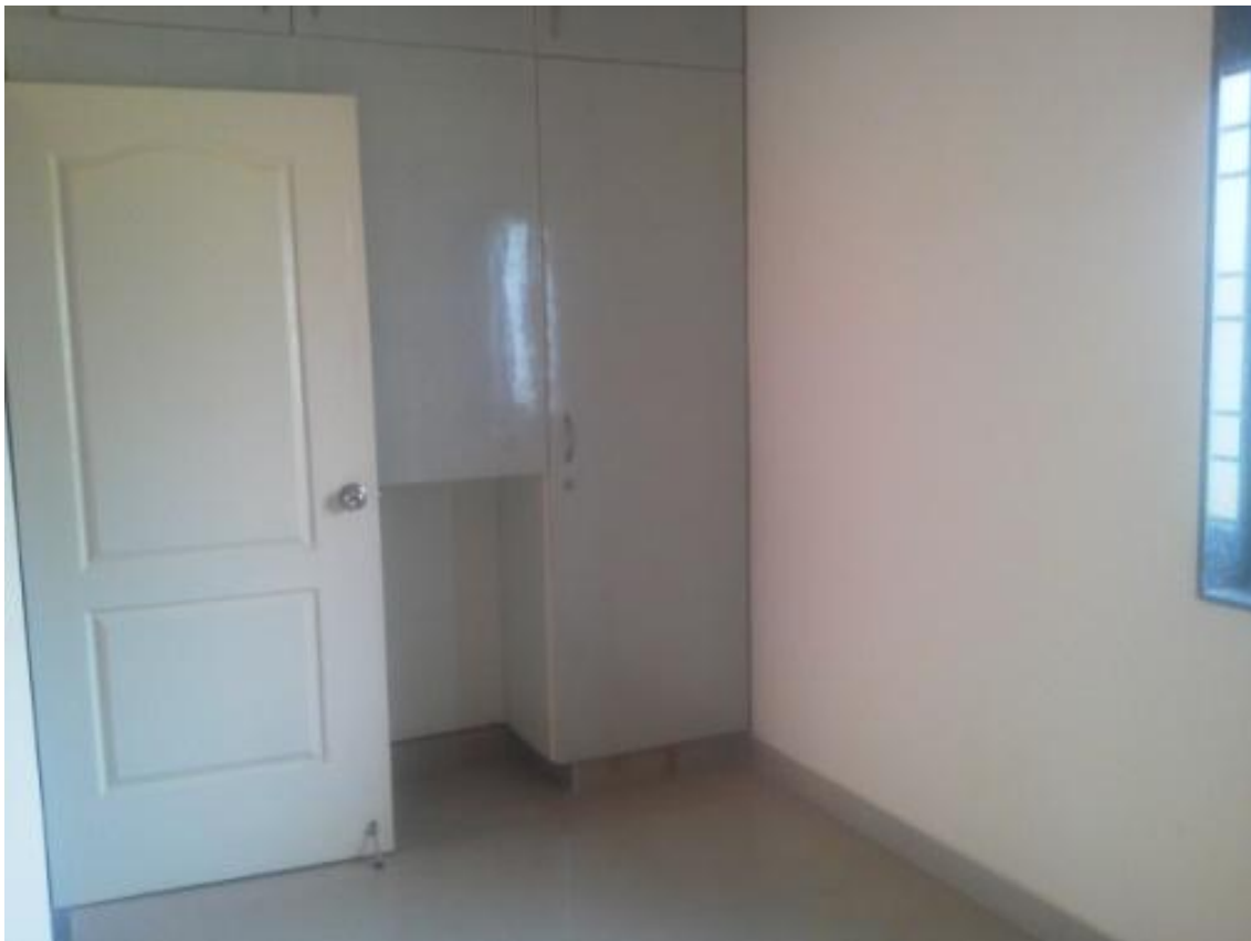
WARDROBE IN MASTER BED ROOM