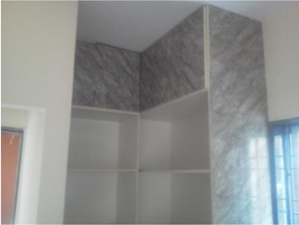
WARDROBE IN KITCHEN