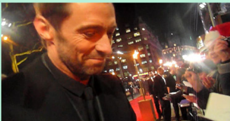
FROM L TO R: SACHA BARON COHEN, RUSSELL CROWE ANNE HATHAWAY & HUGH JACKMAN