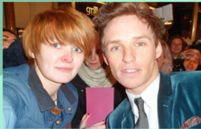
Tamzyn with Eddie Redmayne