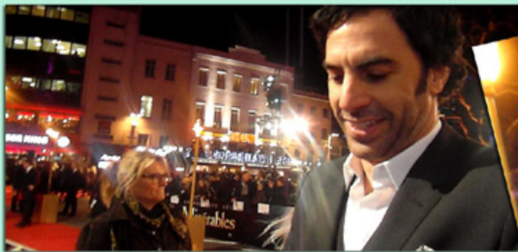
'LES MISERABLES' PREMIERE