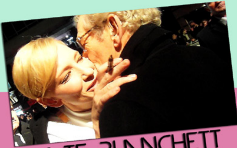
CATE BLANCHETT & IAN MCKELLEN 'THE HOBBIT PREMIERE'