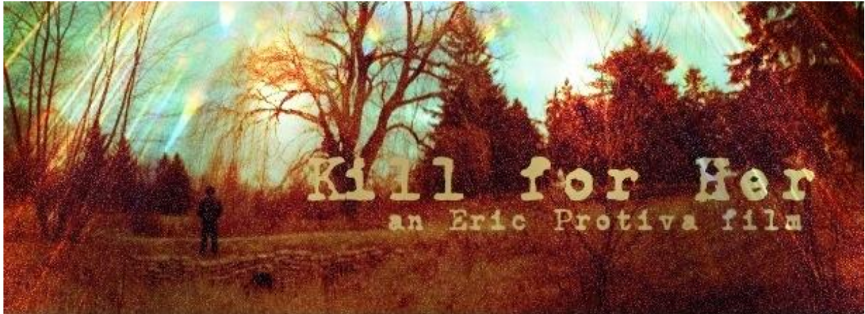
*Teaser banner #2

'Kill for Her' focuses on choices made, and not made, when they can impact your life the most. What life lessons must one learn to be able to paint right from wrong clearly? What you see isn't always what you get. Or is it?"