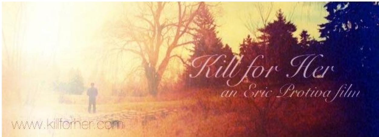
* Teaser banner #3