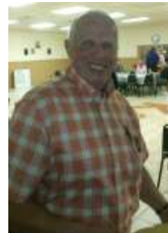
Knight of the Month (pg 2)