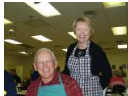
Family of the Month (Pg 2)