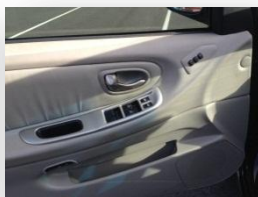
Driver Door (options)