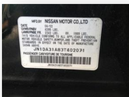
Clear VIN Tag