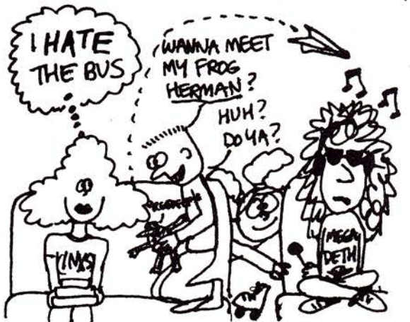
... NOT HAVING A CAR?