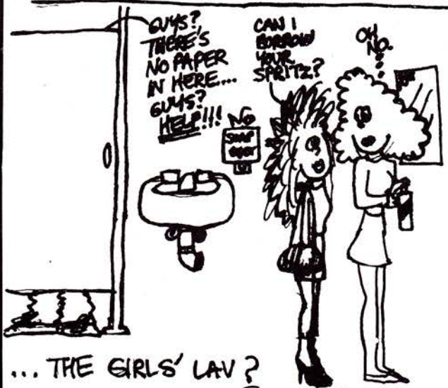
... THE GIRLS' LAV?