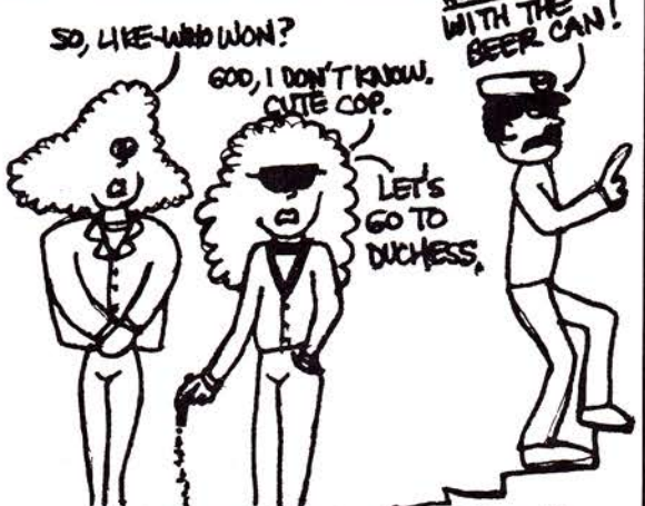
... REMEMBER THE FOOTBALL GAMES?