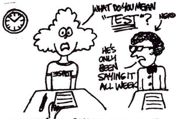
... REMEMBER NOT PAYING ATTENTION?