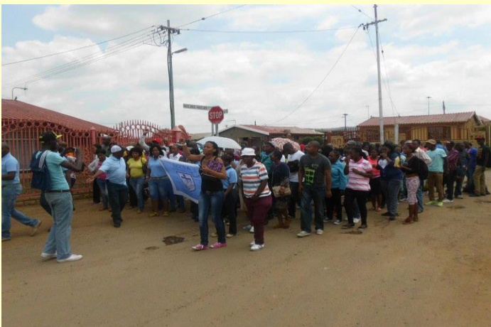
Youth march through Mamelodi

The Conference which consisted of 200 + attendees/ visitors, in a nutshell was a platform where the Youth learned and were encouraged that no matter how high the mountain we should have faith in God. He will bring us through those mountains. God will strengthen us as we get off those mountains because we are not born to remain there but to pass them so as to see the future!