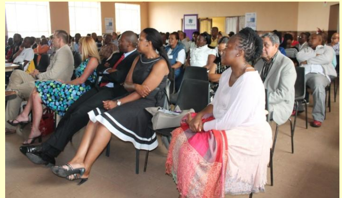
A section of the gathering at the launch