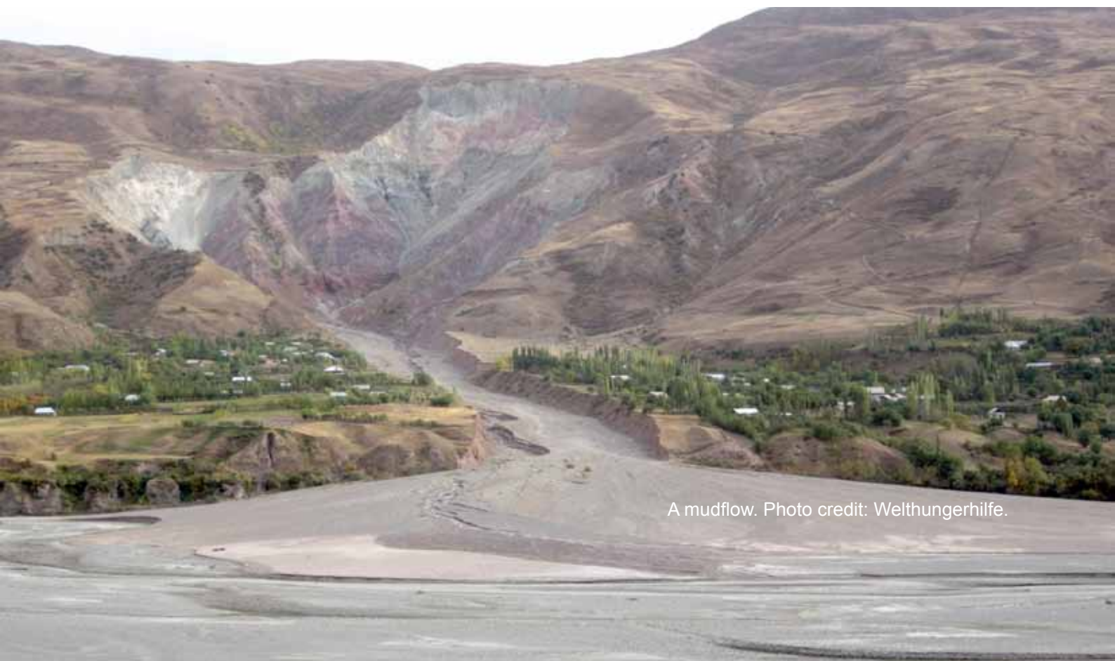
A mudflow.

CRAT methodology has been used to identify particularly vulnerable areas. The methodology was developed under previous DIPECHO projects. In addition to community meetings and physical site inspections, the CRAT team used satellite images to determine the areas which are most at risk.