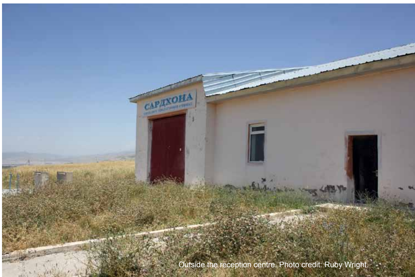
Outside the reception centre.