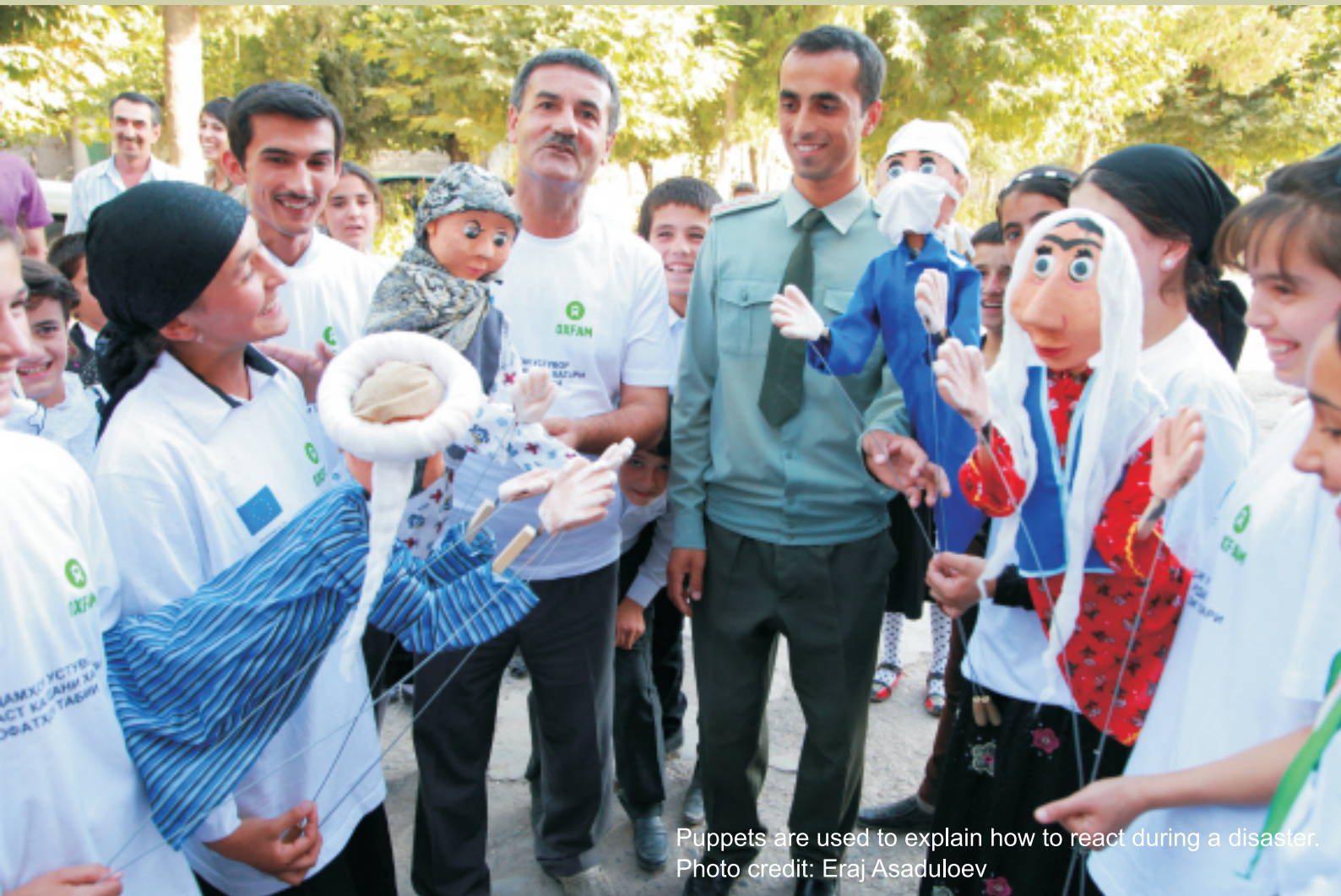
Puppets are used to explain how to react during a disaster.