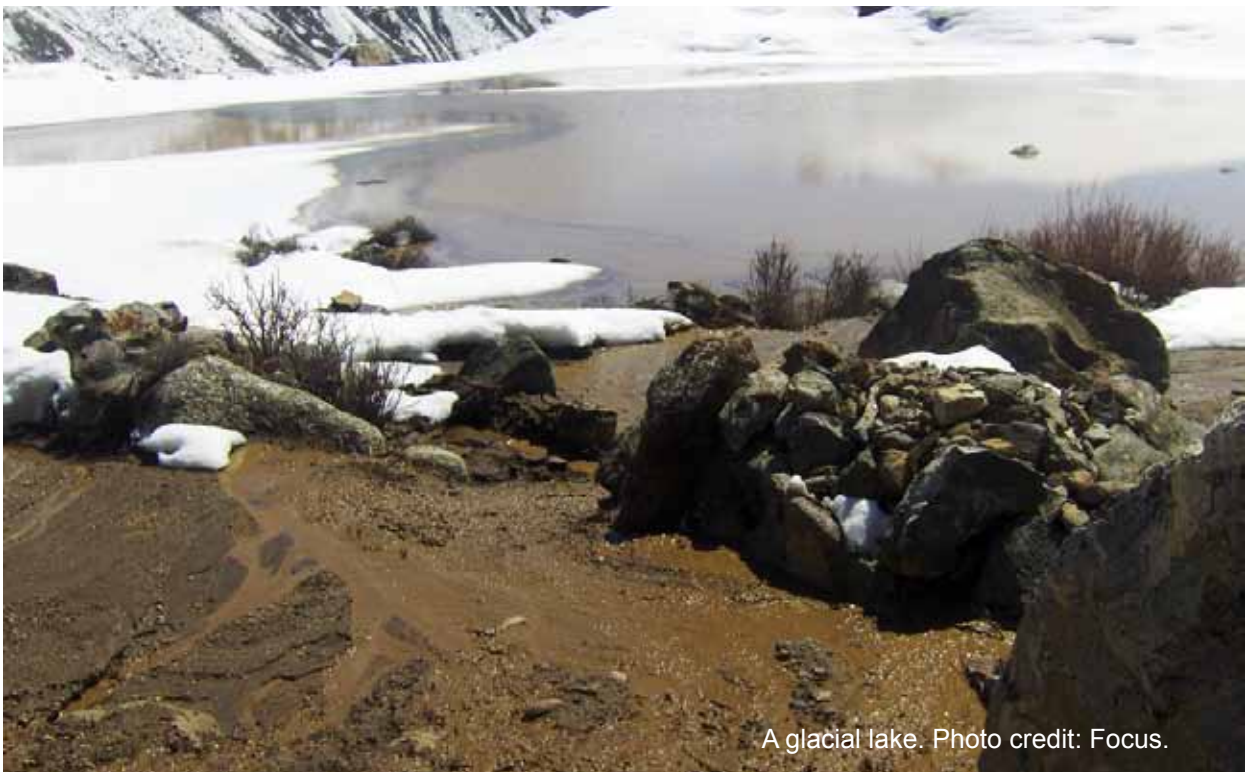
A glacial lake.

During the eight days of mudflow and draining of the lake nobody panicked as there was a high level of awareness and understanding of how to evacuate and how to respond in a disaster. As a result of this knowledge and the CERT training there was no injuries or damage to property.