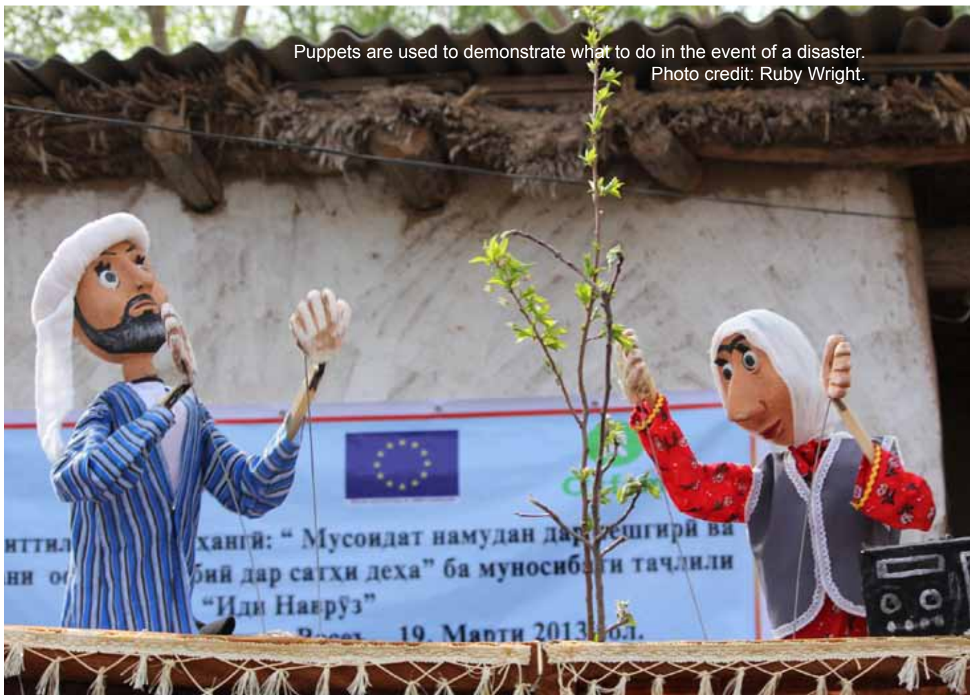
Puppets are used to demonstrate what to do in the event of a disaster.