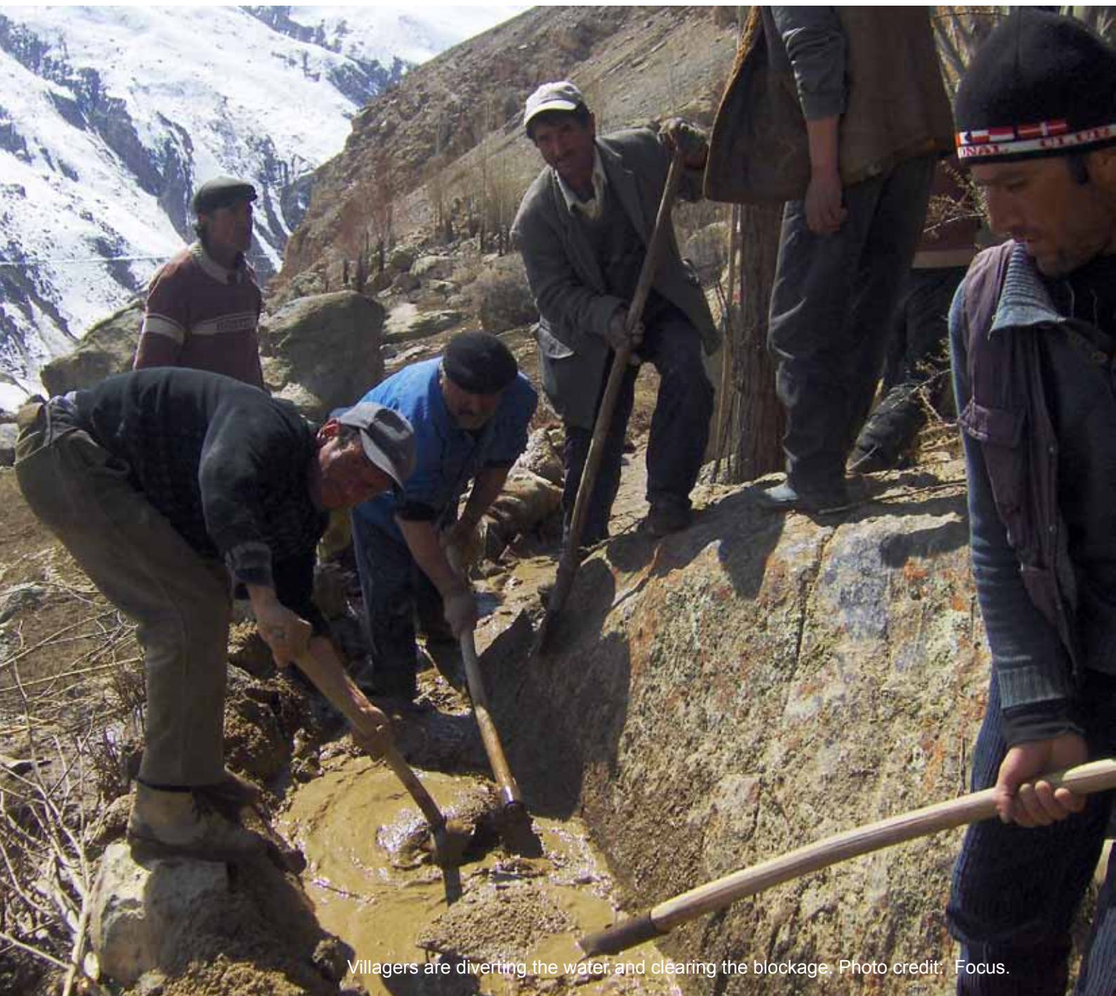
Villagers are diverting the water and clearing the blockage.

to establish a group of 10 active members who would assist in any emergency situation at village level before external help arrives. The group provides basic first aid, search and rescue, evacuation, crowd control and organises