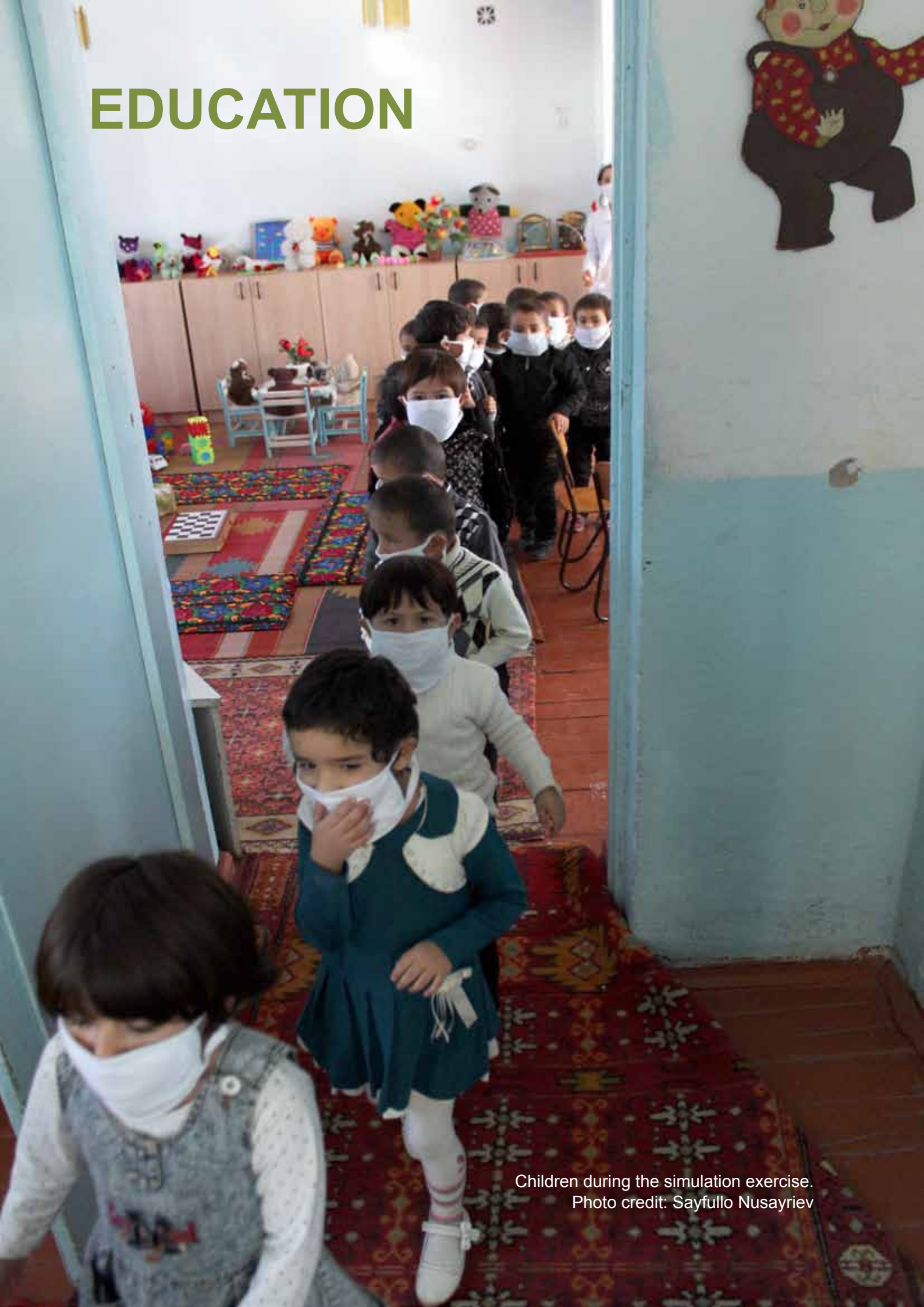
Children during the simulation exercise.