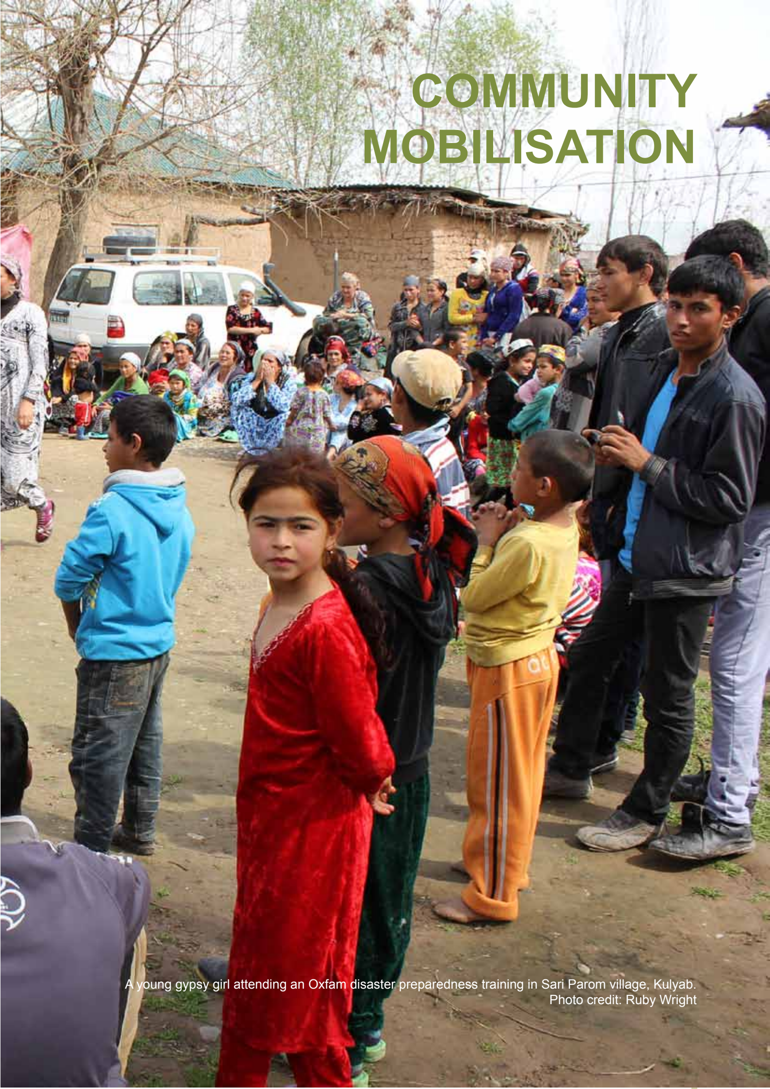
A young gypsy girl attending an Oxfam disaster preparedness training in Sari Parom village, Kulyab.