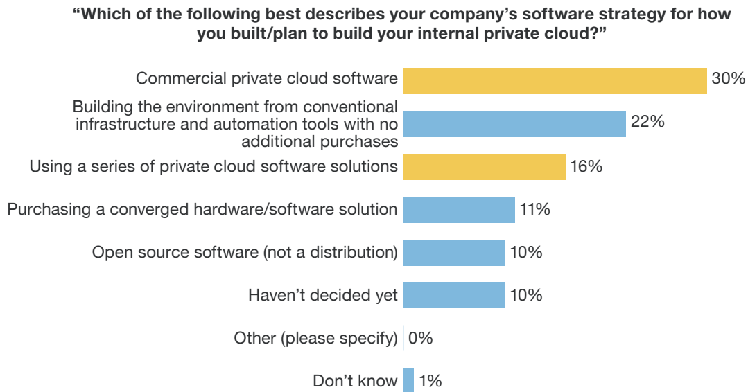
Figure 1 The Most Common Private Cloud Approach Is Commercial Private Cloud Software

Base: 379 enterprise hardware decision-makers who are planning/implemented private cloud