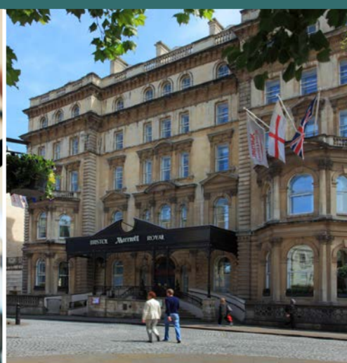
Breakfast The Terrace Restaurant