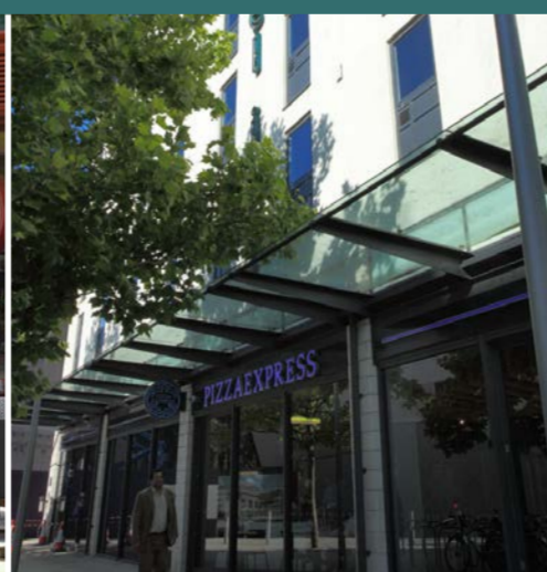
Light Lunch Pizza Express