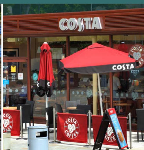
Coffee Costa Coffee