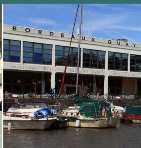
Dinner Bordeaux Quay