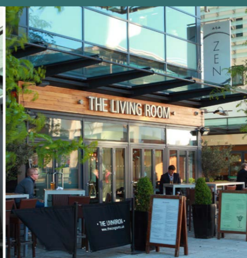
Client Lunch The Living Room