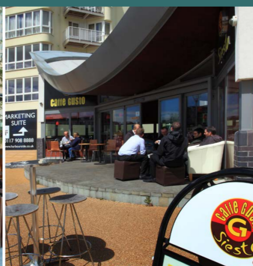
Afternoon Tea Café Gusto