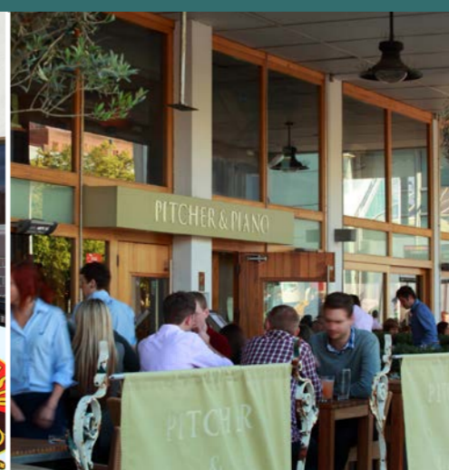
Quick Drink Pitcher and Piano