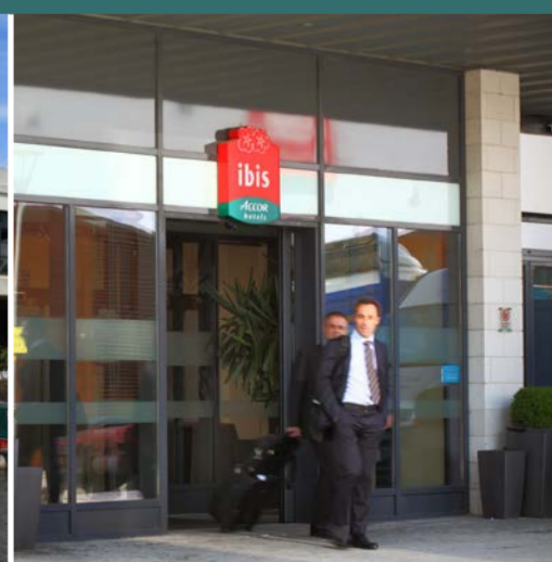
Bed Ibis Hotel