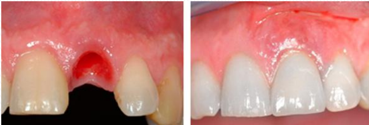
Implant and crown on upper central incisor