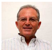
Arnold Cassola (AD)

Claims that the EU shall make sure that Human Rights in Libya are respected and that the Dublin convention has to be changed in order to allow migrants to go to mainland Europe. He complained that the S&D and the EPP are against this move since they want to safeguard their own interests. He mentioned Shultz and pointed out to the fact that although he agrees with the Greens about Dublin convention change, he doesn't take a stand for he is part of Merkel's group that opposes such a move.