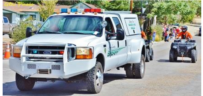
Frazier Park Search & Rescue Unit and ATVs at the 2013 Fiesta Days Parade

These men and women of the Frazier Park team reside in the Frazier Mountain Communities and met once a week for training and drills. They are always available to provide their time and skills to others in need.