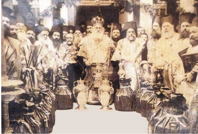
The consecration of Holy Chrism by Patriarch Joachim III in 1912

Now let us again read the quote from “Phos tois en Skotei” published in 1936: “...Therefore, the Official Church of Chrysostom Papadopoulos, recognized by the State, is naked and deprived of the grace and gift of God, because it betrayed the Faith of our Christ by its tolerance and collaboration with atheistic Judeo-Masonry!!!...”