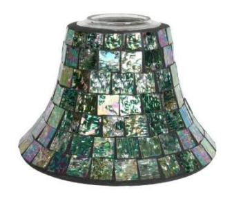
Green and Gold Metallic