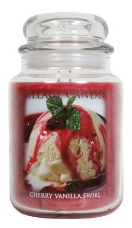
Cherry Vanilla Swirl