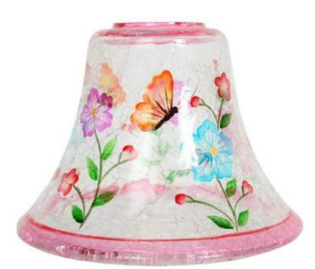
Hand-painted Pink Floral