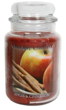
Apples & Cinnamon

Small Candles 701g (up to 55 hours burn time) - £9.49