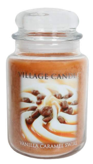
Vanilla Caramel Swirl