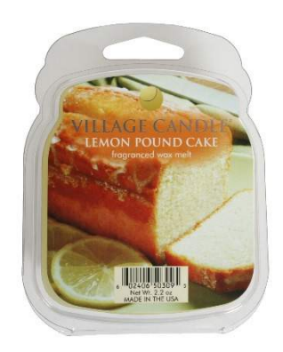
Lemon Pound Cake