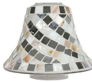
Mother of Pearl