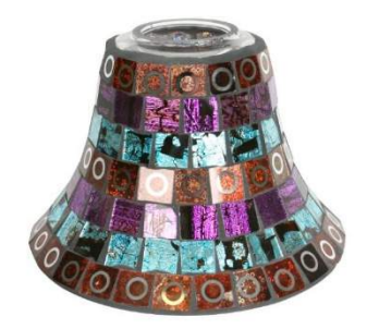
Purple and Blue Metallic