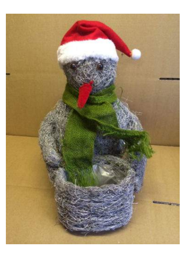
Snowman Planter (H40cm)