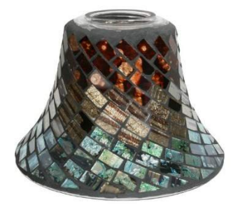
Teal and Brown Metallic