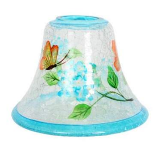
Hand-painted Blue Floral