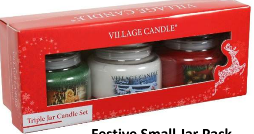
Festive Small Jar Pack

4 Mosaic Votive Holders 4 Festive Votive Candles £16.50