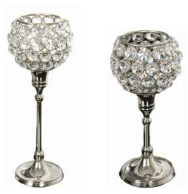
Nickel Crystal Tea Light Holders