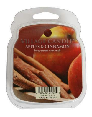
Apples and Cinnamon

Wax Melt Packs - 6x fragranced wax sections per pack (up to 20 hours burn time/3-4 hours per wax section) - £3.50 or 3 for £10