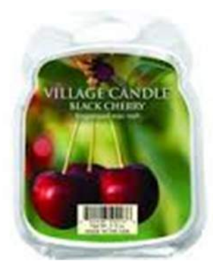
NEW – Black Cherry