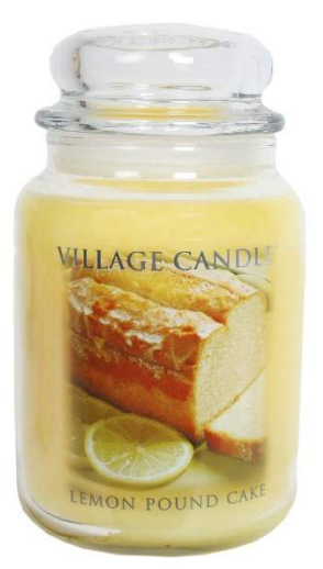
Lemon Pound Cake