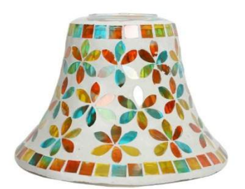
Daisy Burst Lustre