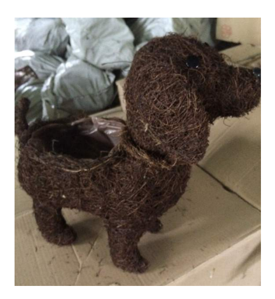
Dog Planter (H34cm) £9.00