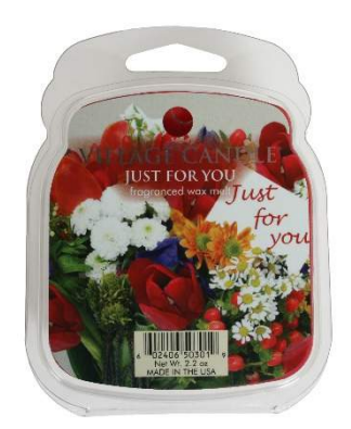
Just For You