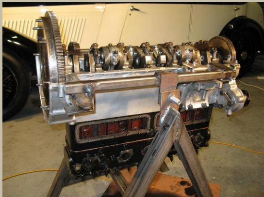
Rolls Royce 25/30 engine

Bensport's friendly restoration team are always happy to discuss customer requirements whether that be full restoration, improvement and modification, or attention to specific bodywork or mechanical elements.