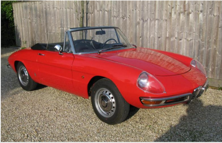
1966 Alfa Romeo Duetto