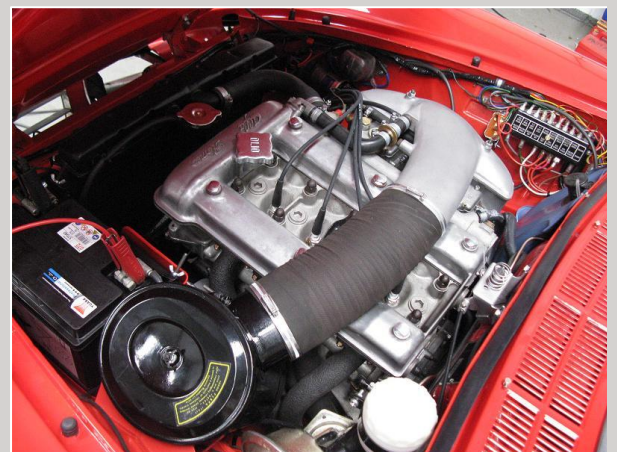
Alfa Romeo Duetto