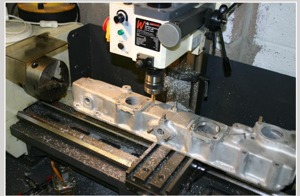
Repair of Jaguar induction manifold.