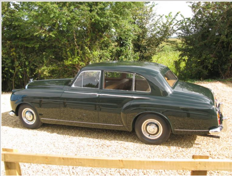
1956 Bentley S1 HJ Mulliner 6002

S1 Mulliner bodied Bentley, engine rebuild, body restoration and repaint.