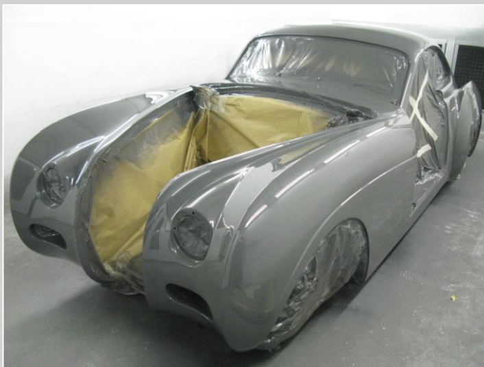
Prototype La Sarthe painted in our bodyshop