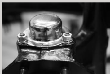
Attention to detail...