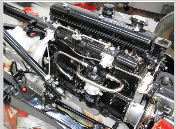
Bentley 4 1/2 litre restoration.