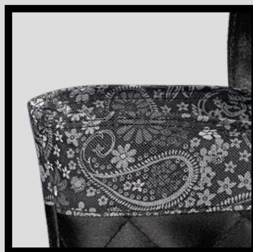
View of paisley pattern