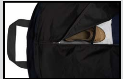
Bottom inside mesh pocket