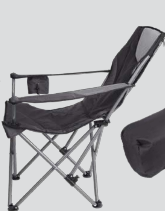
Three position recline