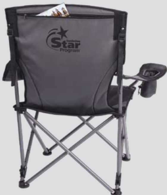
Large full length back pocket