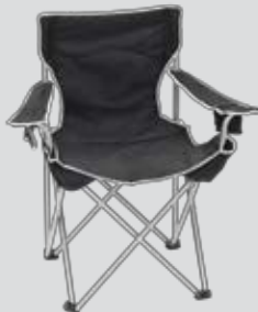
Black / Silver Trim