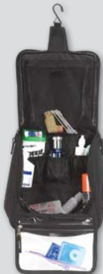
Toiletries Not Included