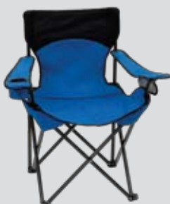
Royal / Black Trim