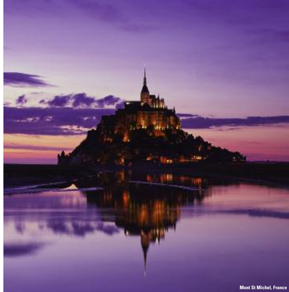
Mont St Michel, France