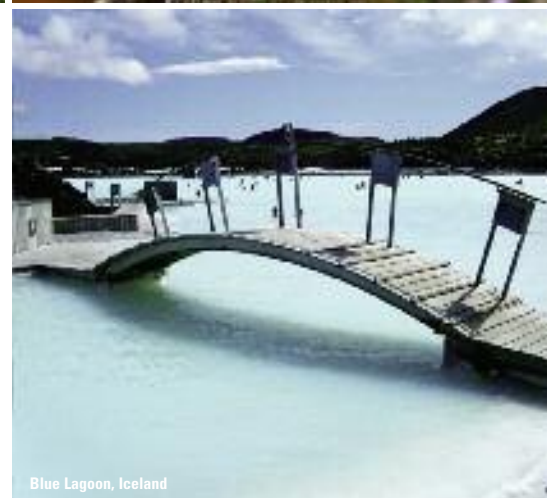
Blue Lagoon, Iceland