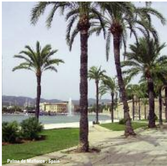
Palma de Mallorca, Spain