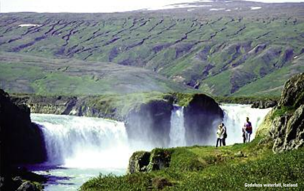
Godafoss waterfall, Iceland