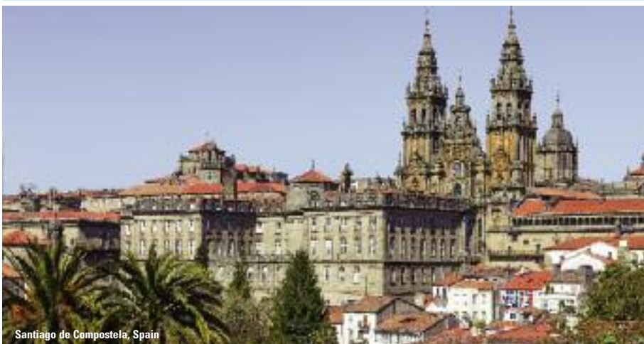
Santiago de Compostela, Spain