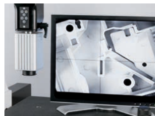
Optical probe management