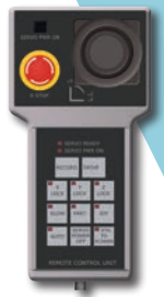
Accurate machine positioning