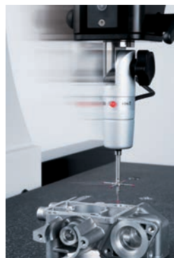
Several speed management options