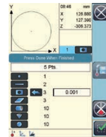
Convenient traceability mode