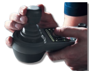
Complete program creation from joystick