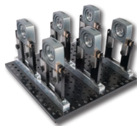
Easy-to-use palletizing mode

Due to its simple and intuitive TESA-REFLEX software, only a minimum of training is necessary!