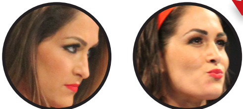
NIKKI BELLA BRIE BELLA

These four put on an excellent match during the final Raw before Wrestlemania. If WWE truly decides to #givedivasachance and the match goes longer than four minutes, this will be one to watch.