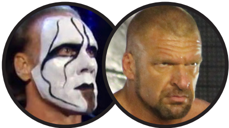
STING TRIPLE H

At Survivor Series 2014 the last soldier of the late 90's WCW/WWE Monday Night Wars surrendered. For years, Sting was the face of World Championship Wrestling and when WWE bought its competition in 2001, Sting was the biggest name NOT to come work for the other guys. So it's a big deal that he's finally going to wrestle in a WWE ring. Triple H is an actual, no-faking, real-life executive vice president of WWE, so you could look at their feud as WCW's major holdout finally working out his frustrations on a representative of his hated rival. In storyline, though, it's because Sting interfered in the main-event match of Survivor Series, got Triple H temporarily "fired," and added injury to insult by hitting him with his finishing move, The Scorpion Death Drop, right in front of everyone! The nerve of that face-painted man!