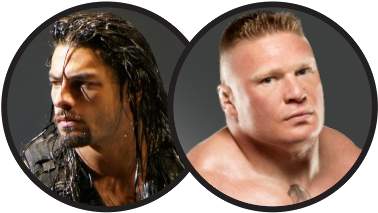
ROMAN REIGNS BROCK LESNAR

Long story short: Whoever wins the Royal Rumble match in January gets a title shot against the WWE champion at Wrestlemania. This year, Roman Reigns won in a fairly unspectacular fashion, prompting boos and general vituperation from the audience that not even an appearance by Reigns' real-life cousin, incredibly popular wrestler and actor Dwayne "The Rock" Johnson, could salve. So basically, there are a lot of people out there who don't like Reigns because his in-ring and microphone skills are frankly subpar and think he doesn't deserve the push corporate is giving him – he was essentially handed his title shot on a silver platter. Reacting to fan outrage, WWE has tried to put some obstacles along Reigns' path to Wrestlemania, which has helped fan perception somewhat. Lesnar is a beast of a wrestler who spent a few years competing in Ultimate Fighting Championship.