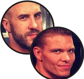
CESARO AND TYSON KIDD

Also pushed back to the pre-show. Watch it for Cesaro and Kidd — they've finally found a niche.