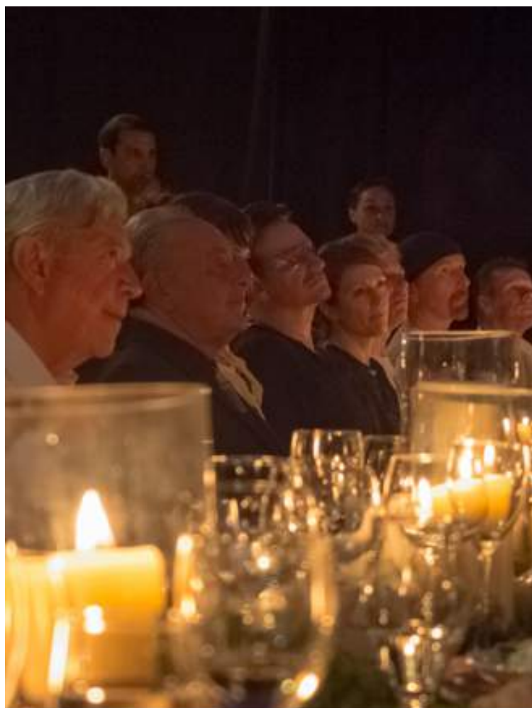
U2, Julianne Moore, & Guests at OMW 2013 Gala Experience In The Ruins