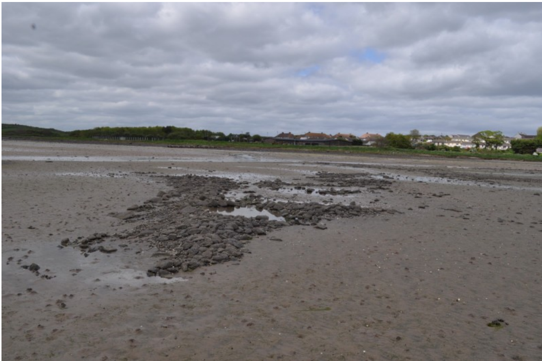
Taken from the south of the feature looking NNW