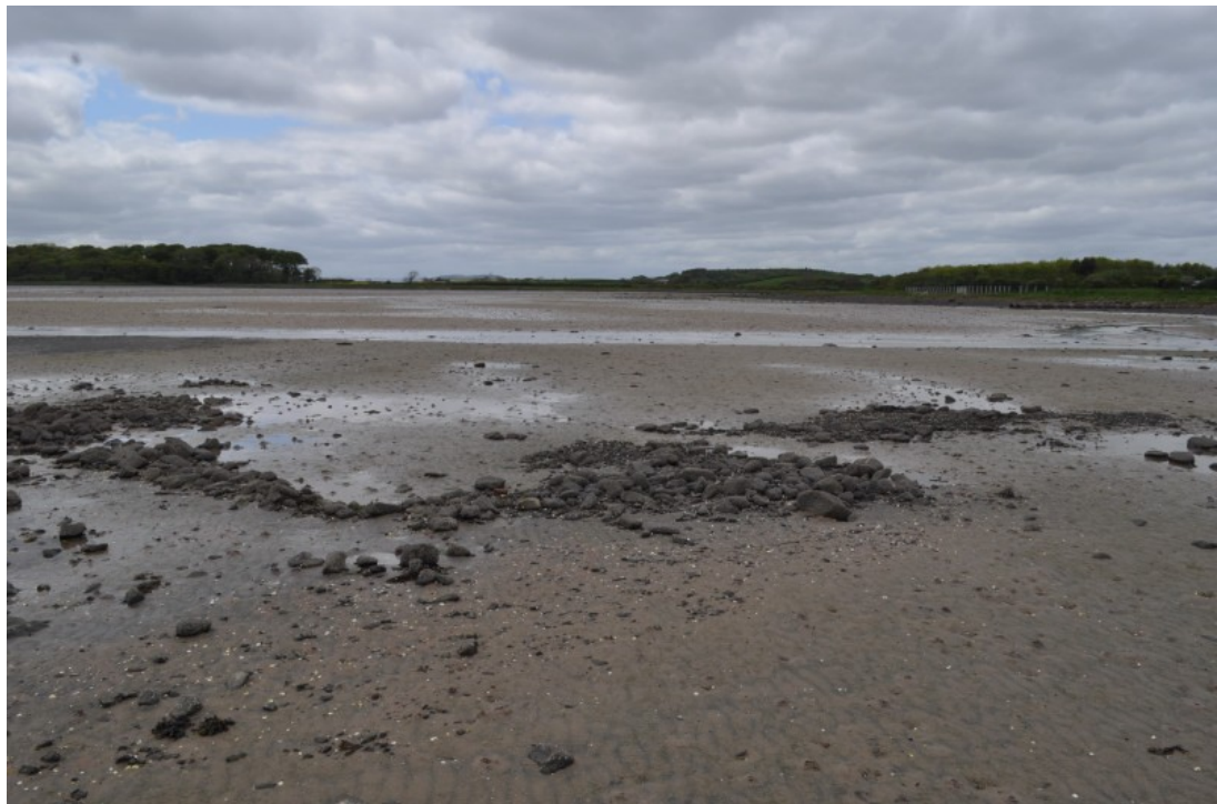
Looking obliquely across the northern end of the feature