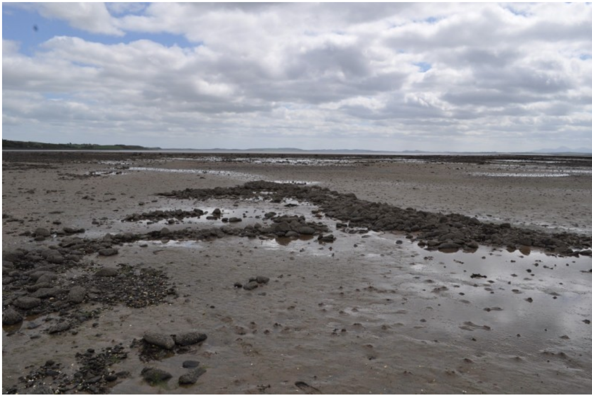
Taken from the north of the feature looking due south.