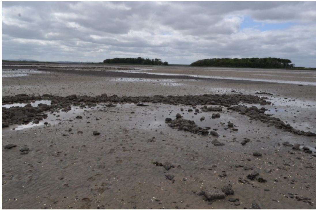
The central section.