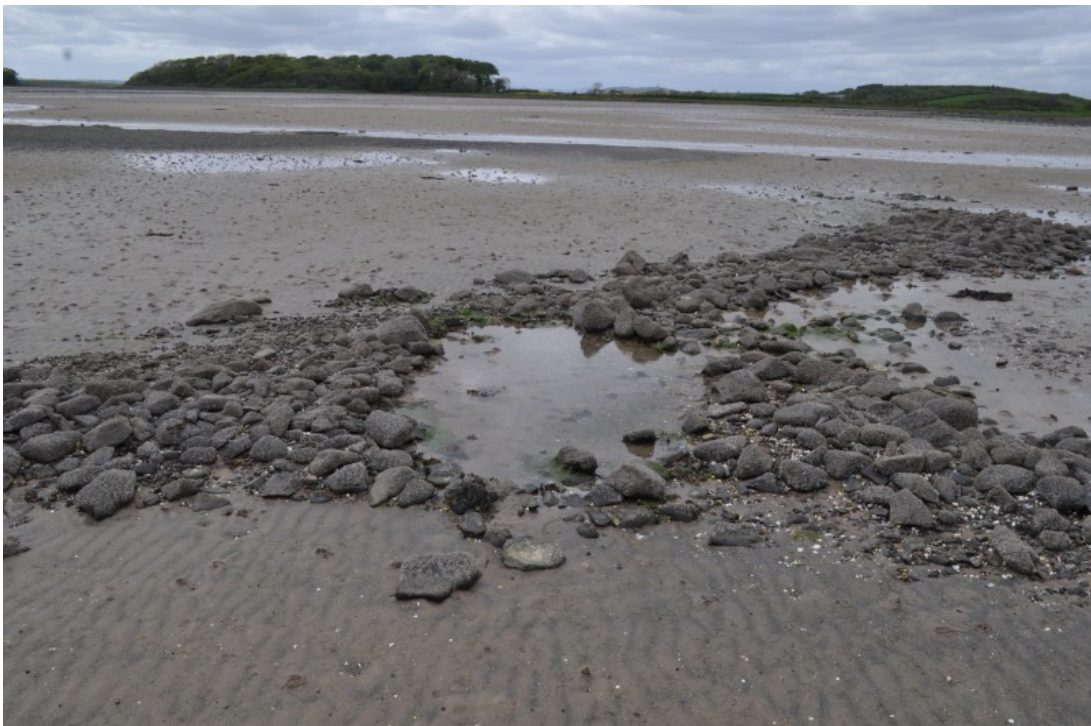
The 'roughly triangular' section.