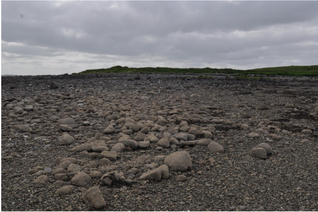
Looking west along the feature as it runs up the foreshore.