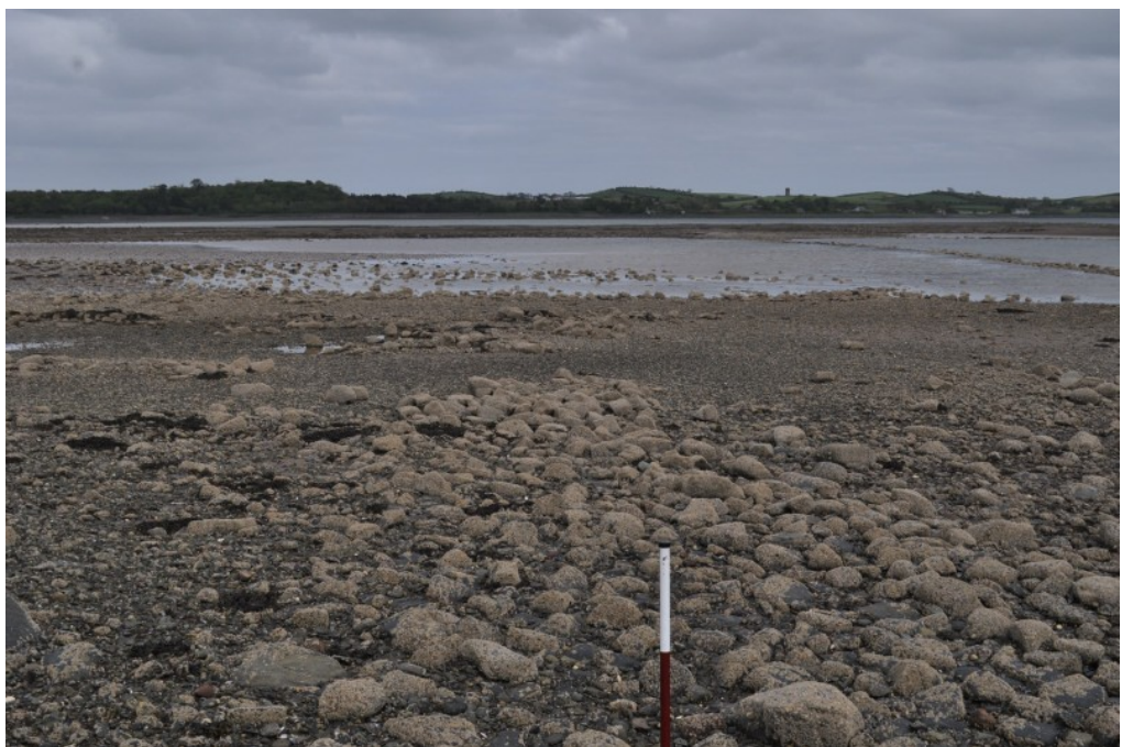
Looking east across the feature with the Kelp Grid MRD 168 071 in the background.