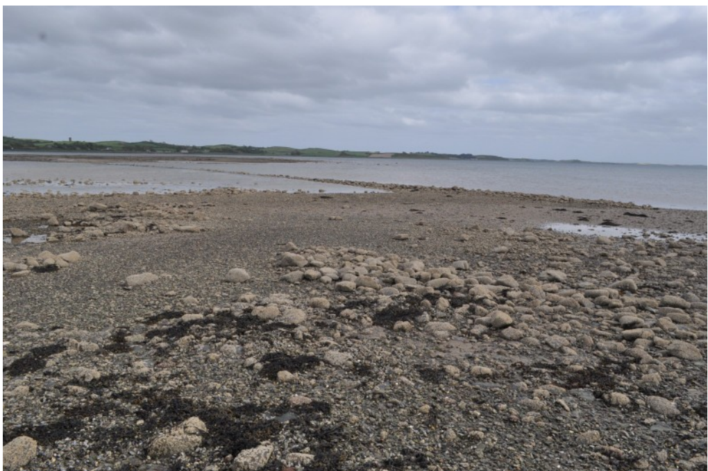
Looking SE across the feature with the Fish Trap MRD168 55 in the background.