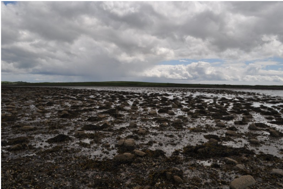
Taken from the foreshore looking approx SE and showing the Kelp Grid, in the background is South Island.