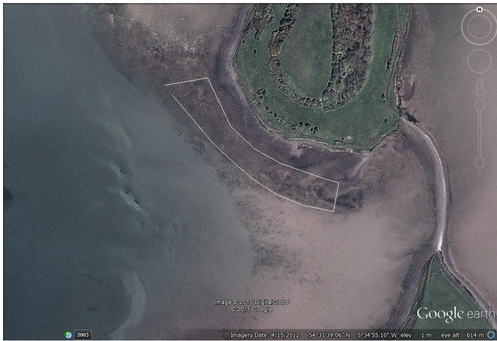
The area covered by the grid.