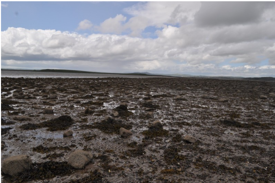
Looking just north of west with Chapel Island in the background.