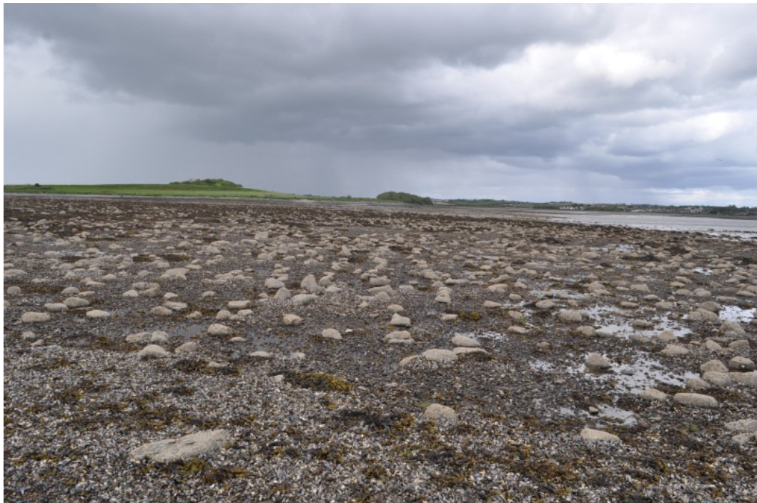
Taken from the southern end of the grid and giving a wider view.