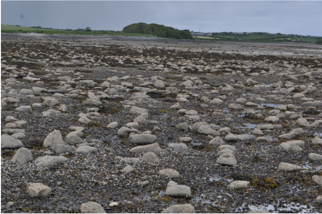
Taken from inside the grid looking north to South Island and showing some of the intact alignments.