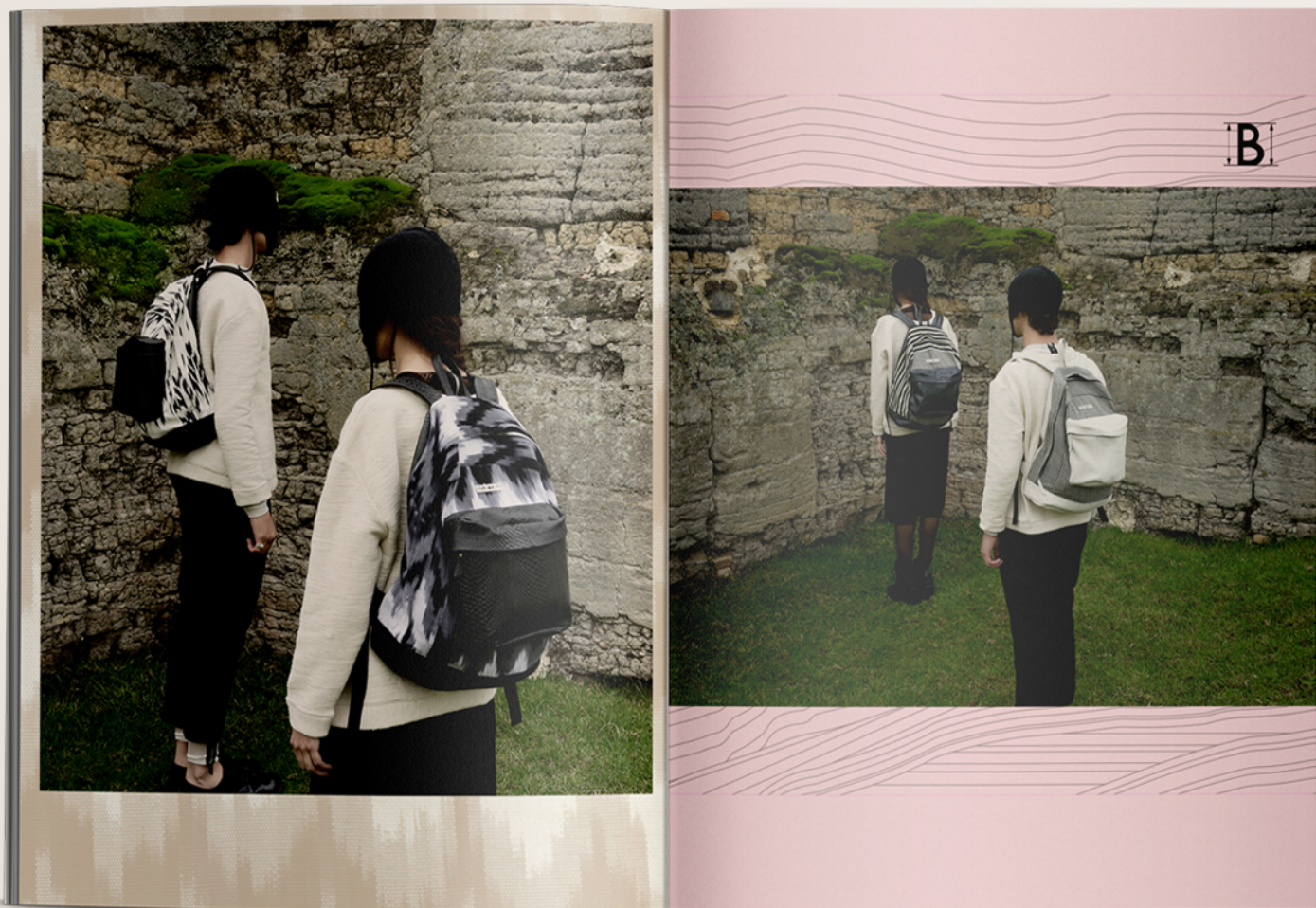
GUATEMALAN COTTON AND LEATHER BACKPACKS