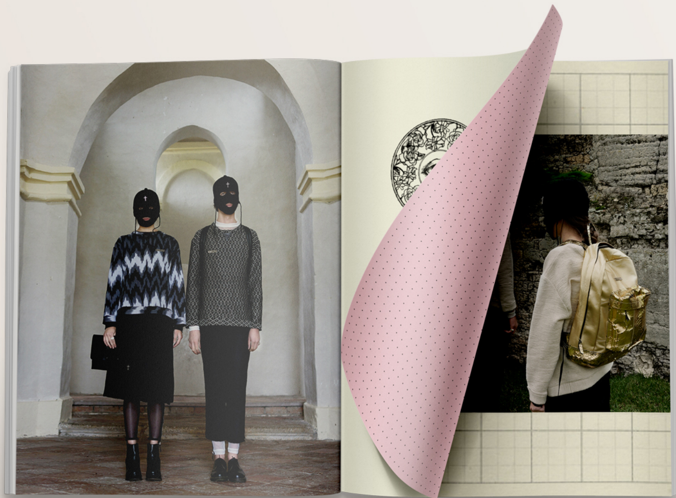
GUATEMALAN COTTON JUMPERS COULOTTE AND TROUSERS MADE FROM PERUVIAN ALPACA — GOLD LEATHER BACKPACK