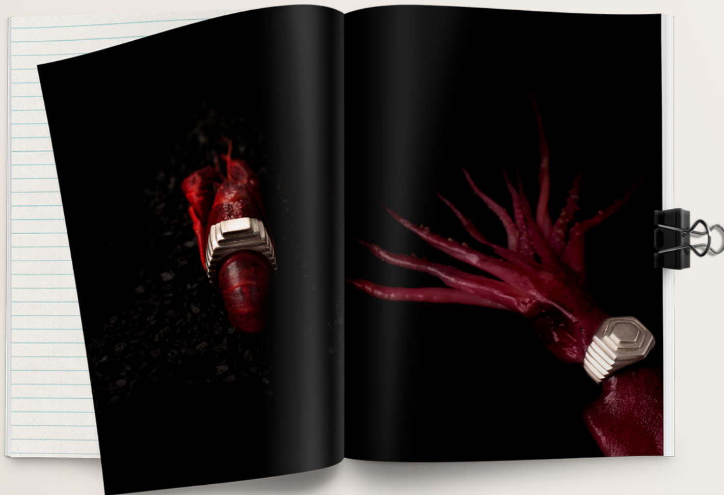
STEPPED SILVER RING — HEXAGONAL SILVER RING