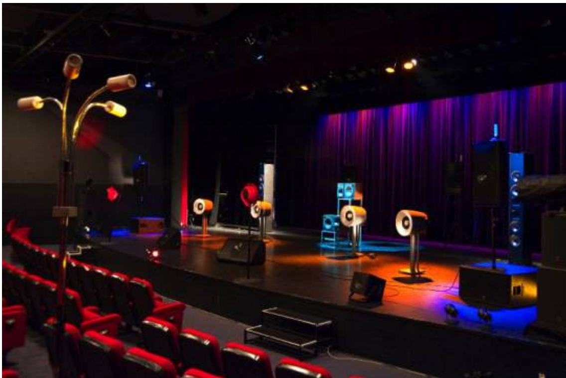
Example of an acousmonium's implantation (for a concert in this case)

Note 2 : The movie can be projected in a DCP format with the voices and foley diffused via the movie theater sound system. While the musical sound (the biggest part of the audio of this movie) will be diffused via the acousmonium.