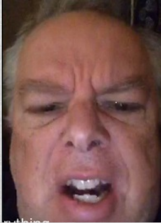
Deranged Dick earlier today.