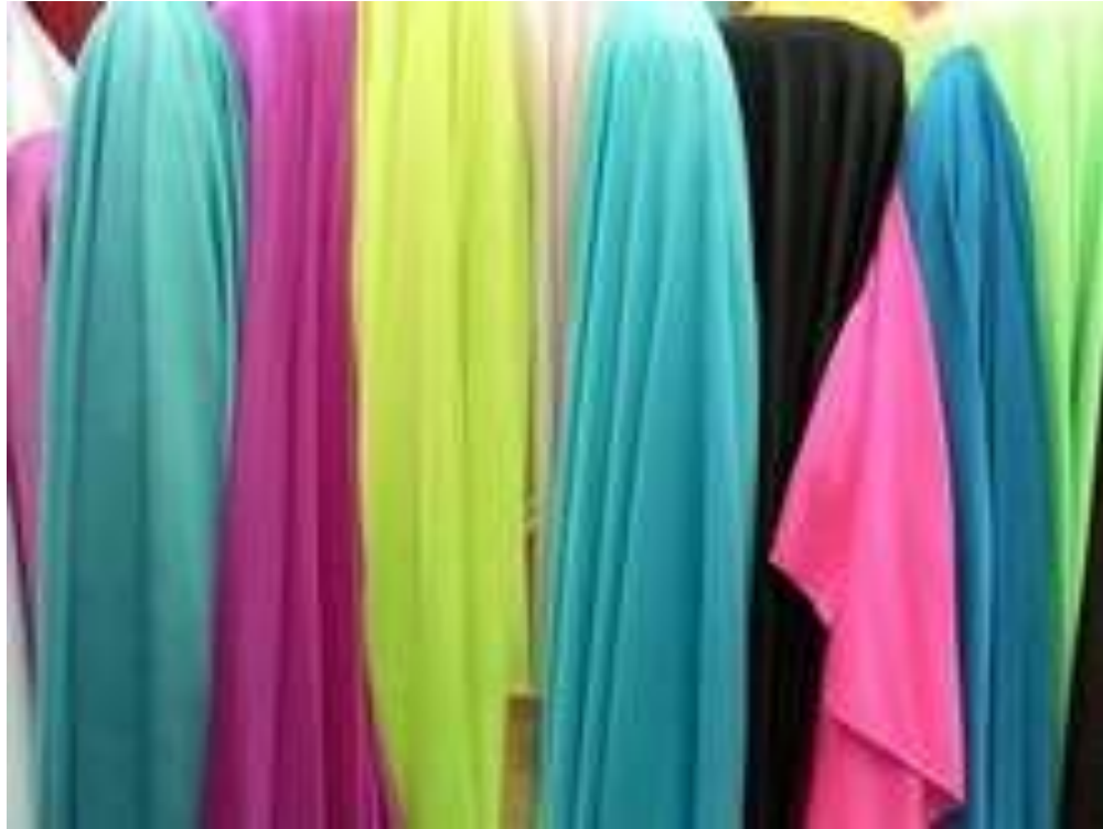
Coral Lycra fabric: Very warm to wear