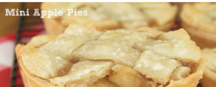
Mini Apple Pies

A tiny classic! These mini apple pie bites from Sprinkle Some Sugar are perfect for sharing at a fall bash or for snacking on throughout the week. Cut a dozen small pie crusts to fill our Mrs. Fields Cupcake Pan and fill each with a sweet apple pie filling. Cut the leftover crust in strips to create charming pie lattice tops. Finish with a dusting of sugar.