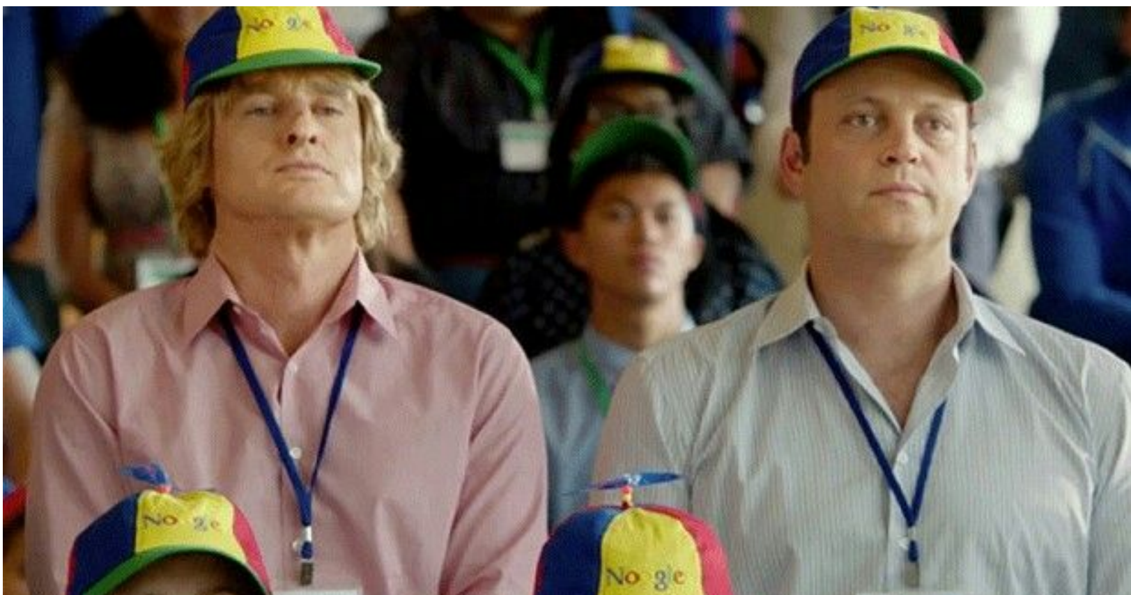
"The Internship" Movie