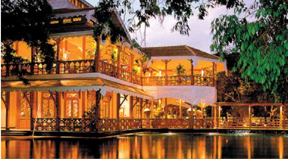
The Governors Residence's stylish rooms exude classical elegance, and modern amenities

Other Questions? Call us at 800.642.2742