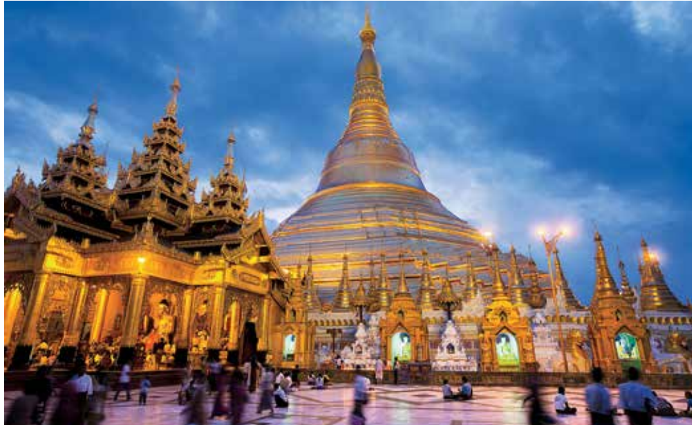
Stunning Shwedagon in Yangon is justifiably iconic