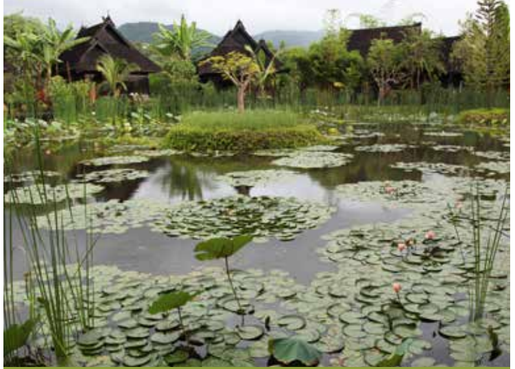
Stilted chalets dot the edge of Inle Lake at the Inle Princess Resort