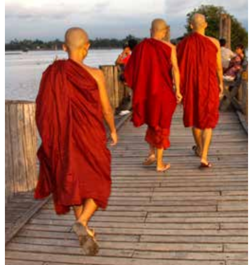
Monks in traditional dress are a common sight