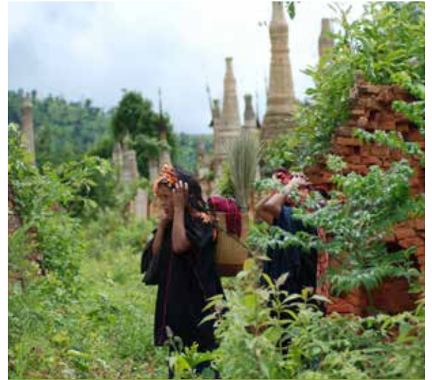
Local women walk daily in the market to shop and socialize

buy and sell their wares, but also catch up on the latest news. We will then board a boat for Indein, a 16th-century temple complex, and another spectacular piece of Burma's vast cultural wealth. Enjoy lunch at Nam Pan village and visit with local silk weavers, boat makers, cheroot makers and blacksmiths. The remainder of the afternoon will be spent exploring beautiful Inle Lake. We will see the famous Intha fishermen rowing their fishing boats with a swirling move of their leg, pass floating gardens (villagers actually grow tidy rows of vegetables on the lake's surface), stop at a weaving village and visit several Shan temples. We will also pay a visit to the Mine Thauk Orphanage, which we have been supporting for many years.