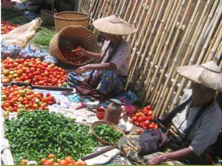
Tribal peoples and villagers buy and sell their wares at local tribal markets

Other Questions? Call us at 800.642.2742