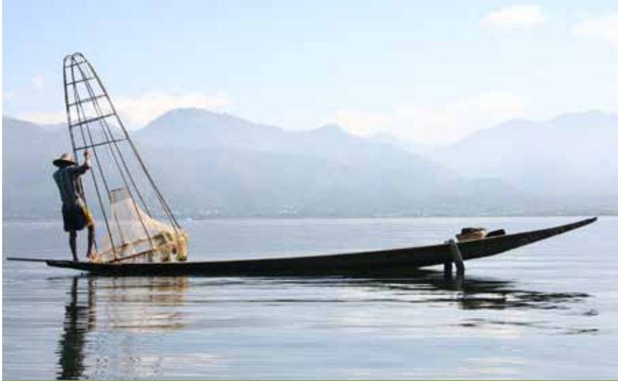
A fisherman checks his netting for the catch of the day at Inle Lake

Other Questions? Call us at 800.642.2742