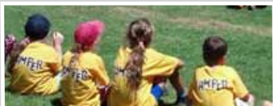
Summer Zoo Camp Pg. 2