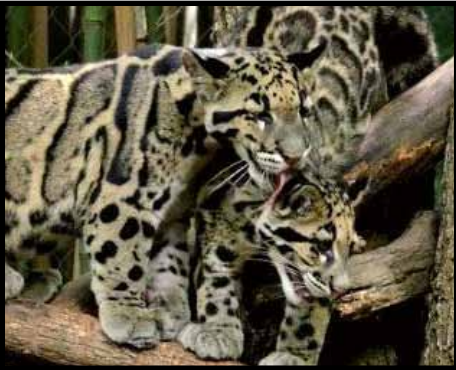
Clouded Leopards, Suree & Malee