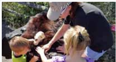
Breakfast with the Animals Pg. 3