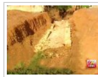
Akyem Otumi: Collapsed Bridge