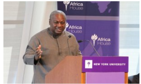
President Mahama In New York