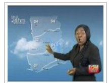
Oct 22, 2013