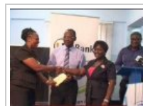
UT supports GJA Awards