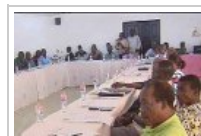
Corporate Social Responsibility Policy