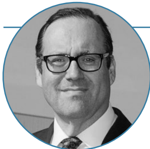
Richard Harrington MP Vice Chairman The Conservative Party

First point of contact between clients and prospective clients, compiling key research, contributing to product development, assisting with the building of sales presentations.