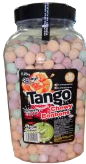
TANGO ASSORTED BON BONS