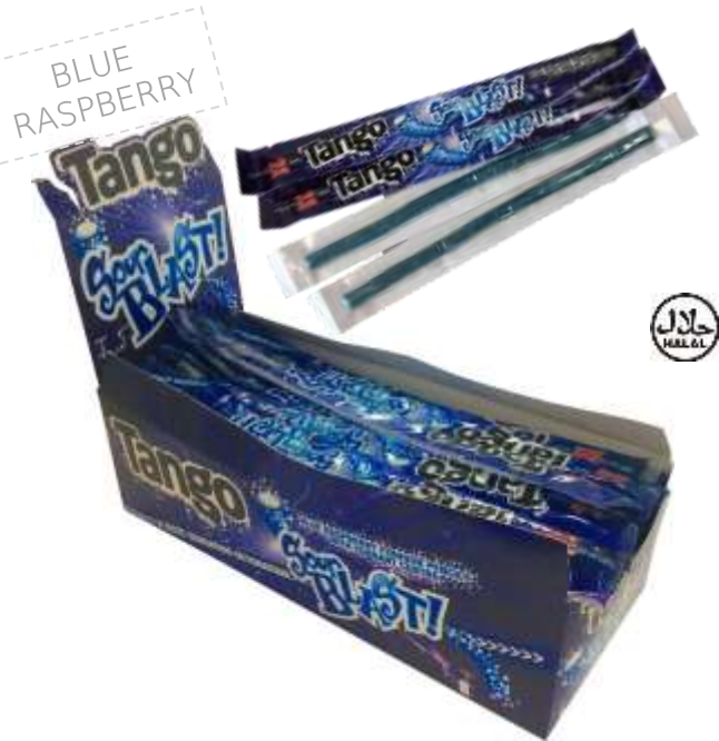
TANGO SOUR BLAST TOOBZ