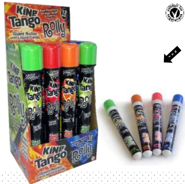
ASSORTED KING TANGO ROLLY