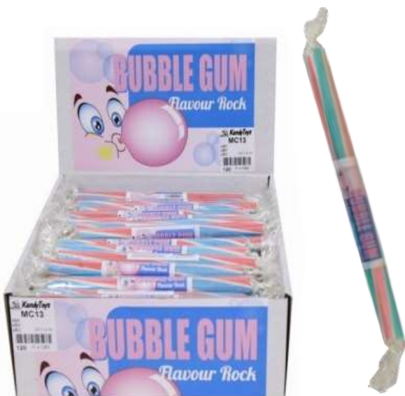
BUBBLE GUM FLAVOUR ROCK