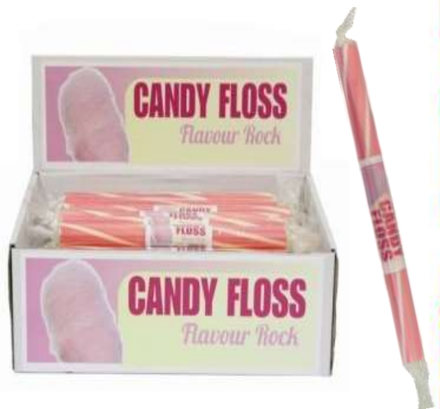
CANDY FLOSS FLAVOUR ROCK