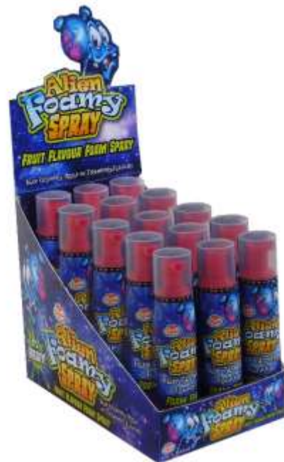
ALIEN FOAM SPRAY