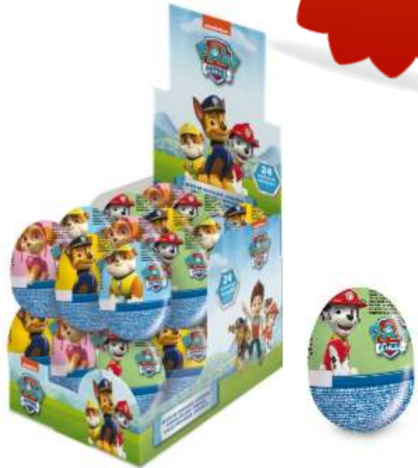
PAW PATROL MILK CHOC EGG