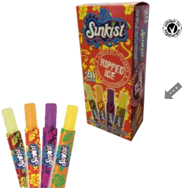
SUNKIST RIPPED ICE