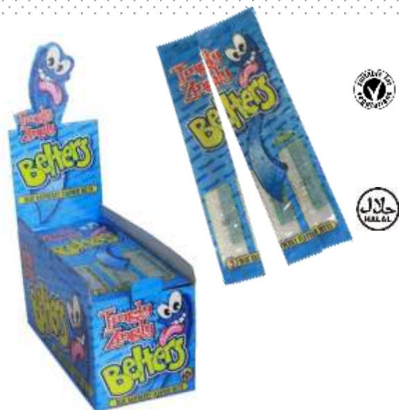
BELTERS BLUE RASPBERRY