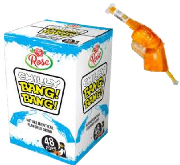
CHILLY BANG BANG DRINK