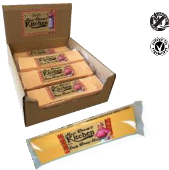
IRON BREW NOUGAT