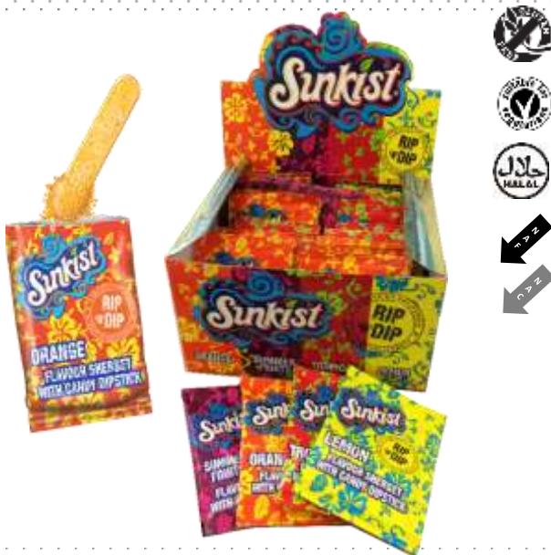
SUNKIST RIP 'N' DIP