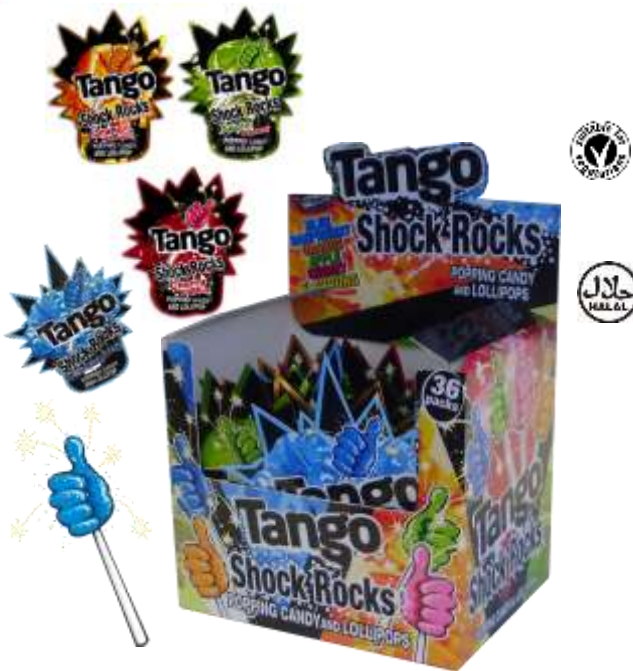
TANGO SHOCK ROCKS