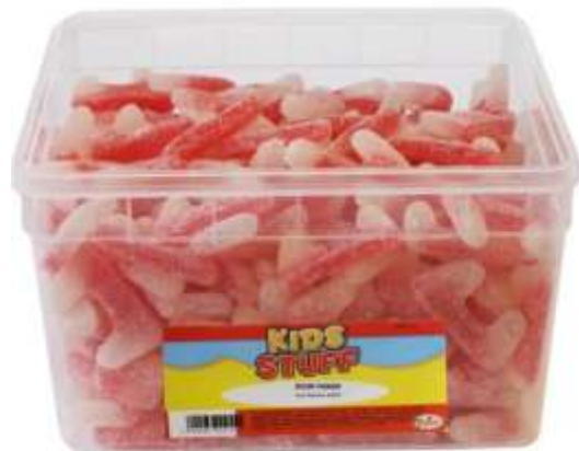
5p FIZZY FANGS