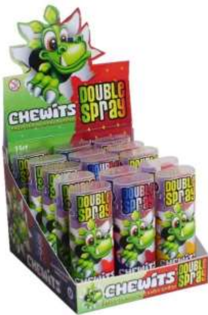
CHEWITS DOUBLE SPRAY