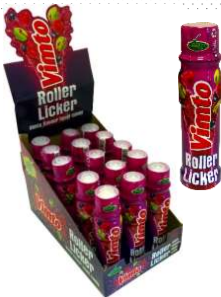
VIMTO ROLLER LICKER