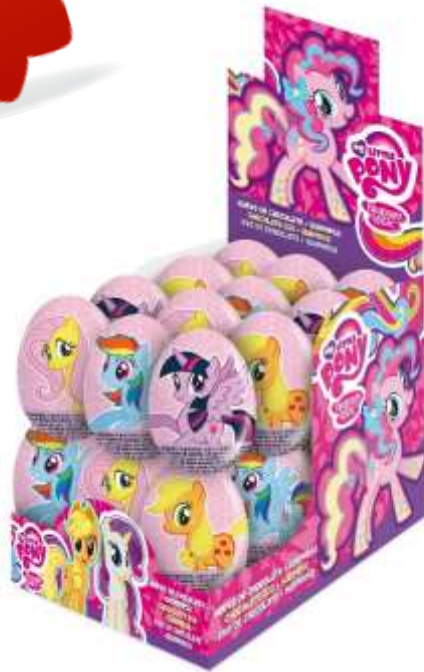
MY LITTLE PONY MILK CHOC EGG