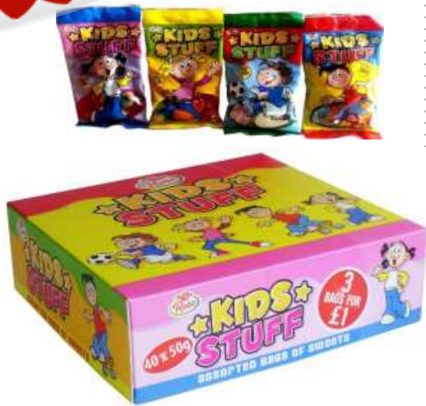
KIDS 3 FOR £1 MIX UPS