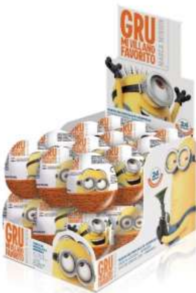
MINIONS/ GRU MILK CHOC EGG