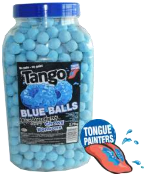
TANGO BLUE BALLS