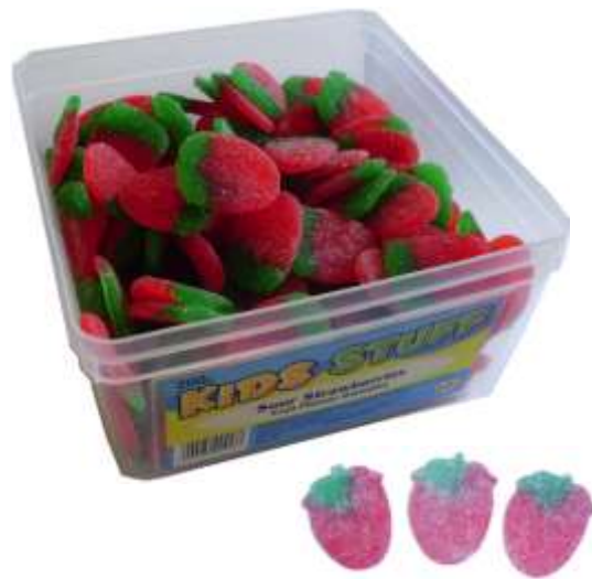
5p FIZZY STRAWBERRIES