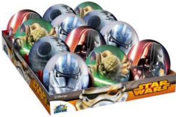
STAR WARS BAUBLES