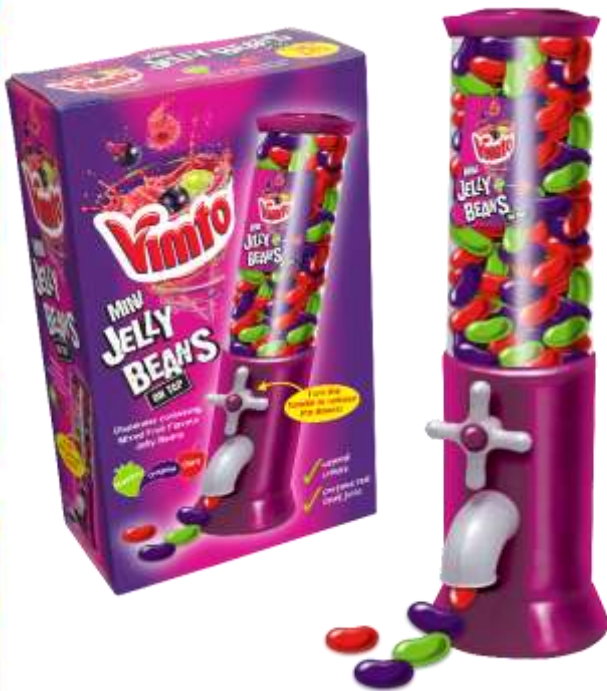
VIMTO JELLY BEANS ON TAP