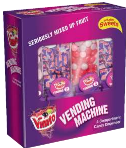
VIMTO VENDING MACHINE