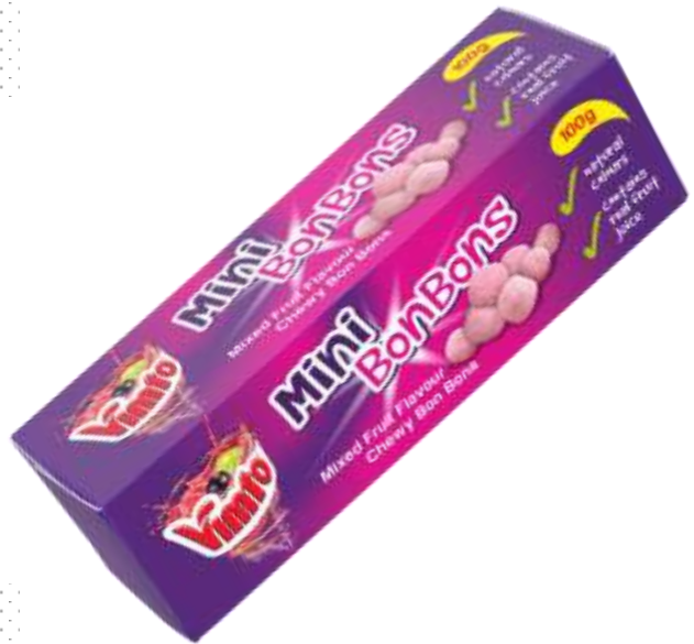
VIMTO BON BON BOX