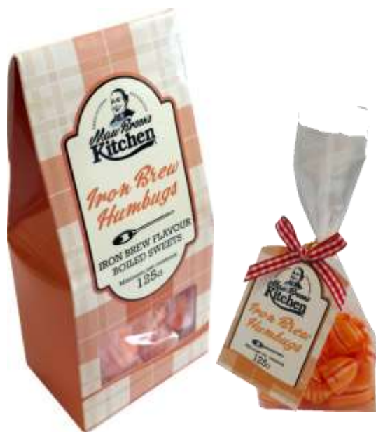
IRON BREW HUMBUGS