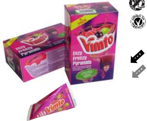
VIMTO EEZY FREEZY PYRAMIDS