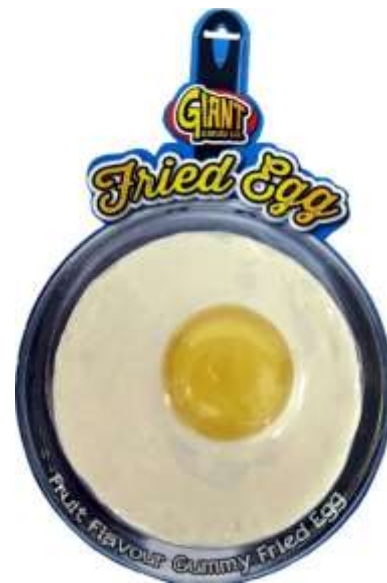
GIANT FRIED EGG