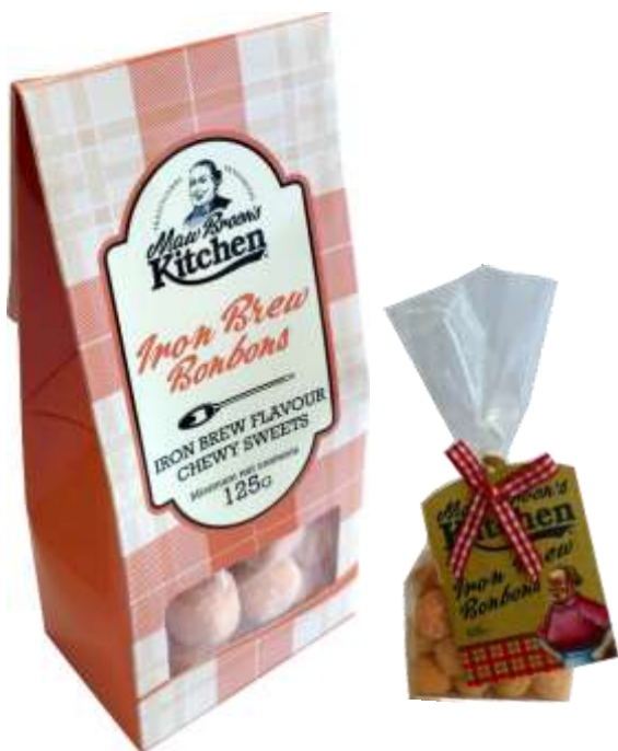
IRON BREW BONBONS