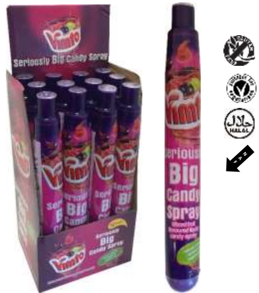
VIMTO SERIOUSLY BIG SPRAY