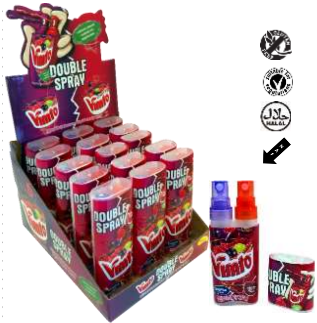
VIMTO DOUBLE SPRAY