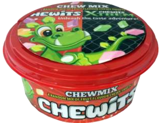
CHEWITS DUO TUB