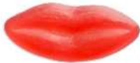
5p HOT LIPS