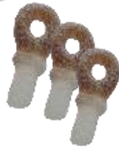
5p SOUR COLA SOOTHERS