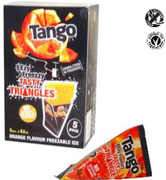
TANGO ORANGE TRIANGLES