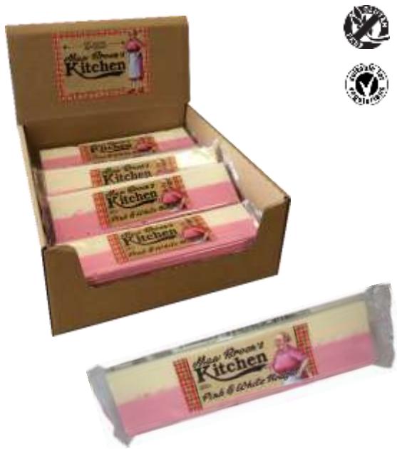
PINK & WHITE NOUGAT