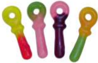
10p WINEGUM SOOTHER