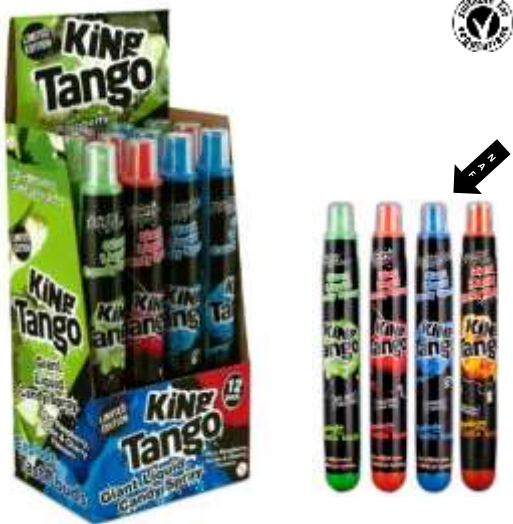
ASSORTED KING TANGO SPRAY