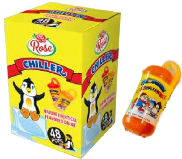
CHILLER DRINK WITH STRAW