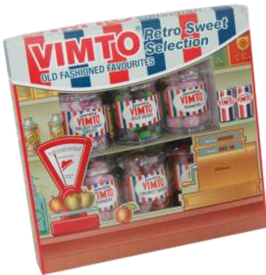
VIMTO OLD FASHIONED SWEET SHOP