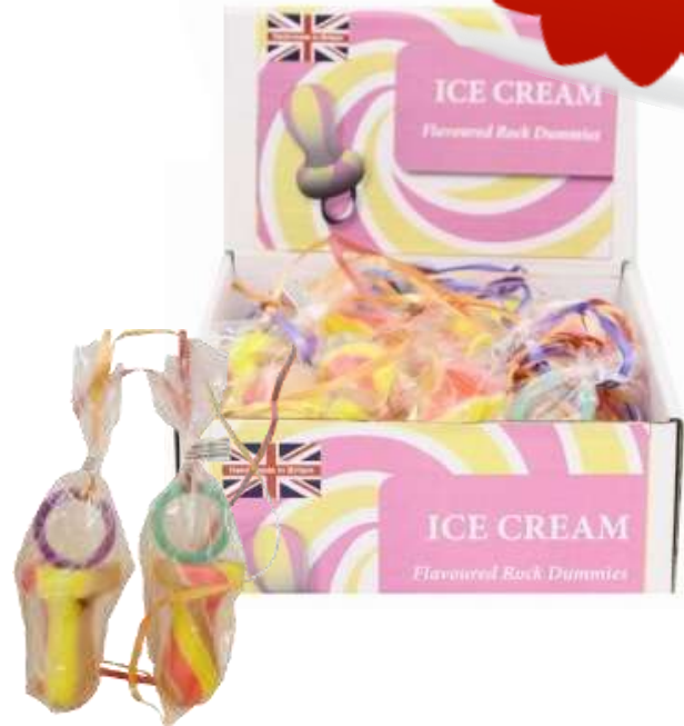
ICE CREAM FLAVOUR DUMMY