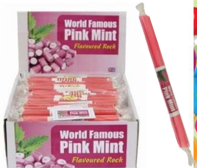
PINK MINT FLAVOUR ROCK