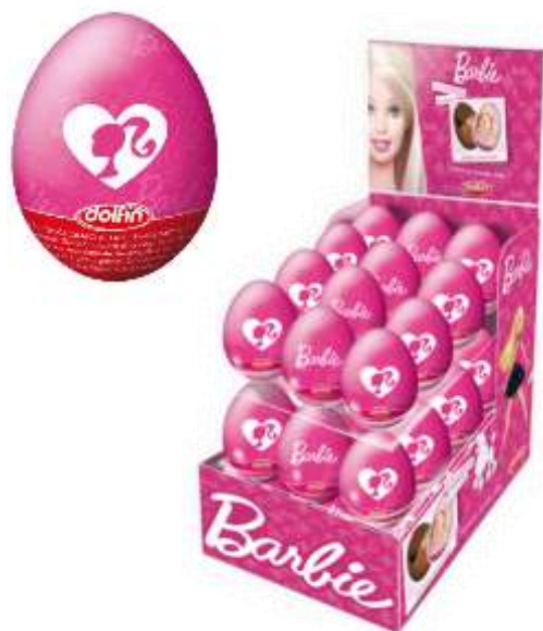
BARBIE MILK CHOC SURPRISE EGGS