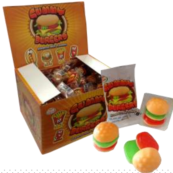
GUMMY BURGERS 10p