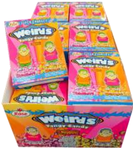
WEIRDS STRAWBERRY & ORANGE