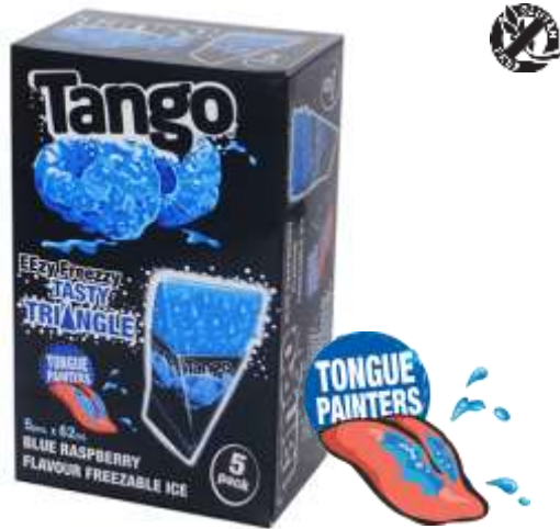
TANGO BLUE RASP TRIANGLES