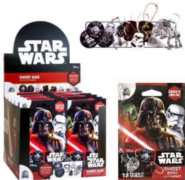
GIFT BAGS STAR WARS