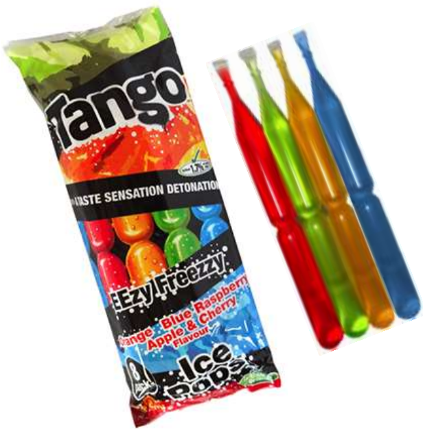
TANGO EEZY FREEZY ICE POPS