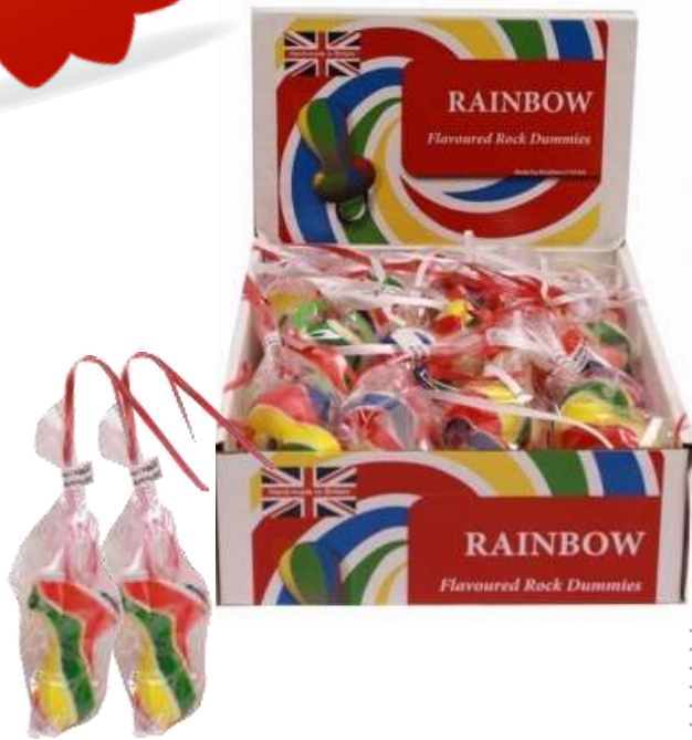
FRUITY RAINBOW FLAVOUR DUMMY