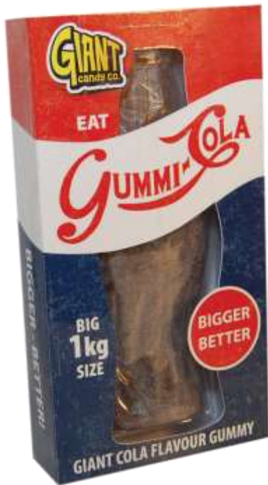
GIANT COLA BOTTLE