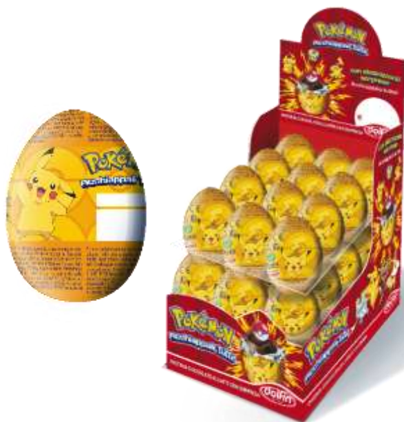
POKEMON MILK CHOC SURPRISE EGGS