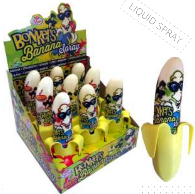
BONKERS BANANA SPRAY