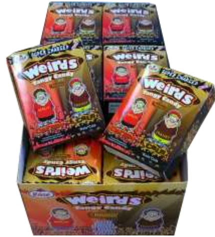
WEIRDS COLA & CHERRY