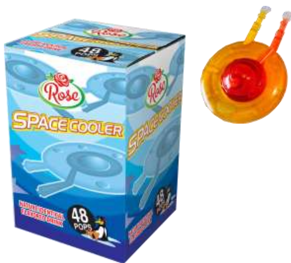
SPACE COOLER DRINK