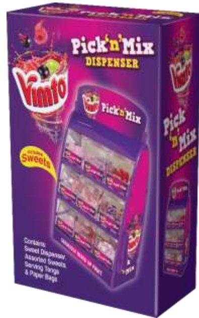
VIMTO PICK N MIX