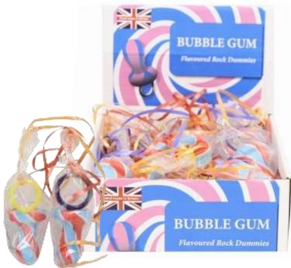
BUBBLE GUM FLAVOUR DUMMY