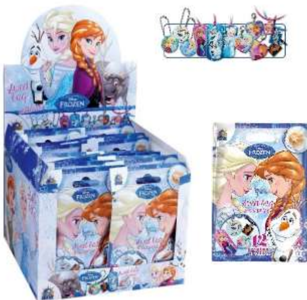
GIFT BAGS FROZEN