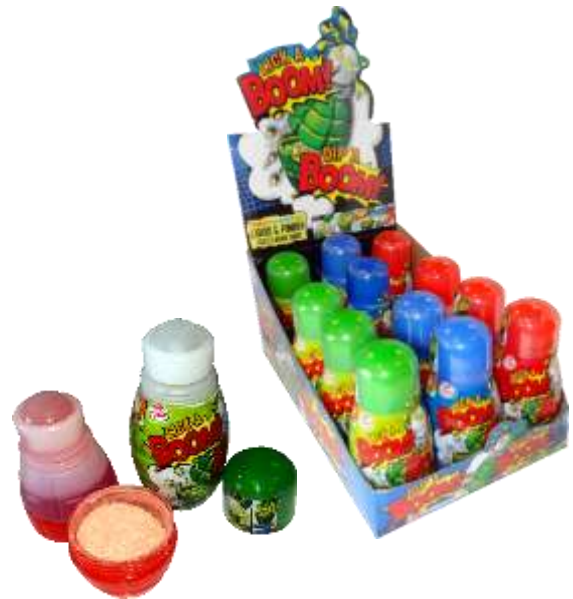
BOOM BOOM LICK IT/ DIP IT