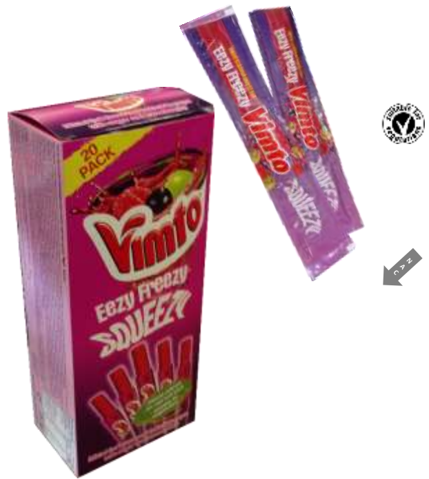
VIMTO EEZY FREEZY SQUEEZY