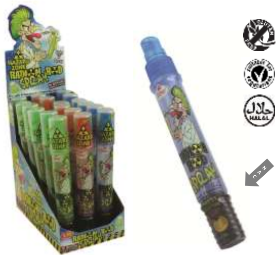
RADION LIGHT UP SPRAY