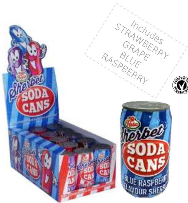
SHERBET CANS XXL