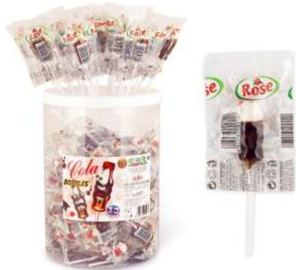
3D COLA LOLLIPOPS