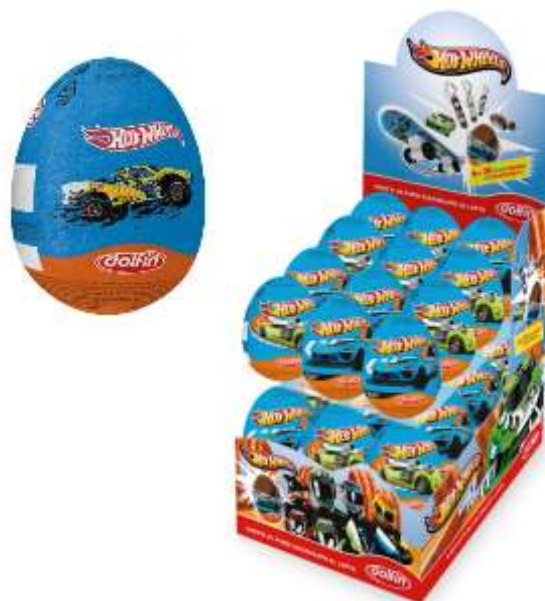
HOT WHEELS MILK CHOC SURPRISE EGGS