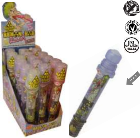
RADION LIGHT UP ROLLY