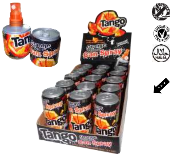
TANGO CAN SPRAY