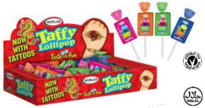
TAFFY DRUMSTICK TATTOO