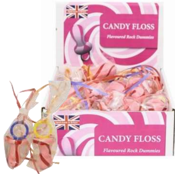
CANDY FLOSS FLAVOUR DUMMY