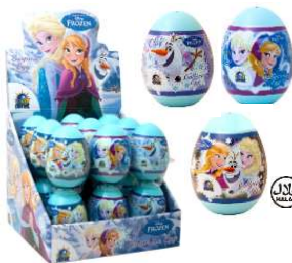
FROZEN SURPRISE EGG