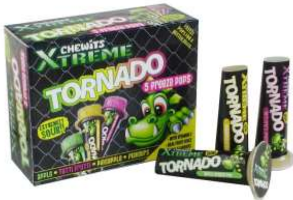
CHEWITS EXTREME TORNADO