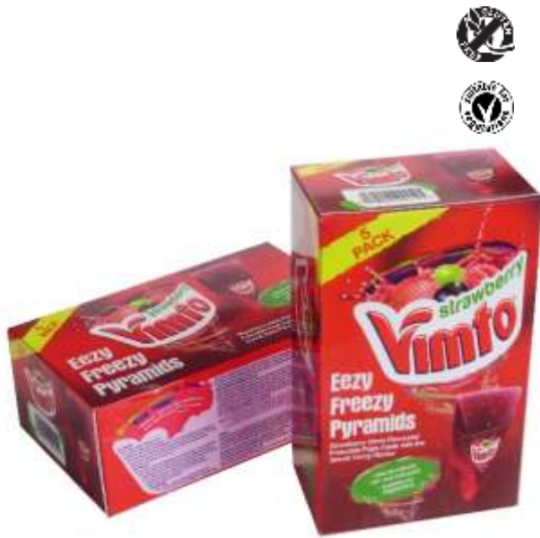
VIMTO EEZY FREEZY STRAWBERRY