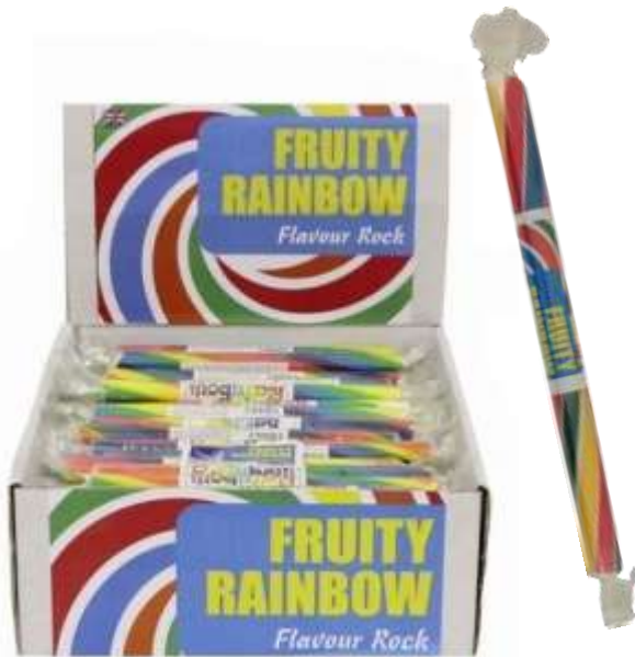
FRUITY RAINBOW FLAVOUR ROCK