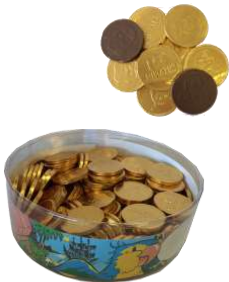
MILK CHOCOLATE GOLD COINS