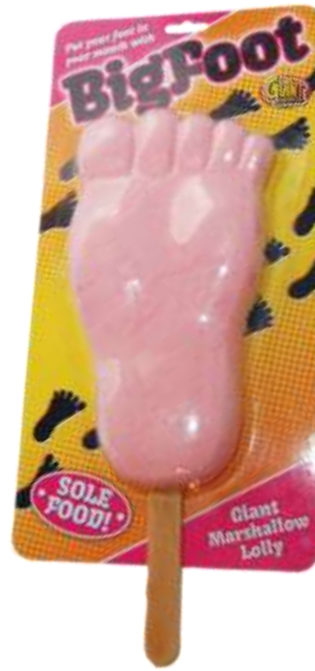
GIANT FUNNY FOOT