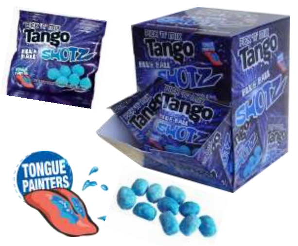
TANGO MINI BLUE BALL SHOTZ