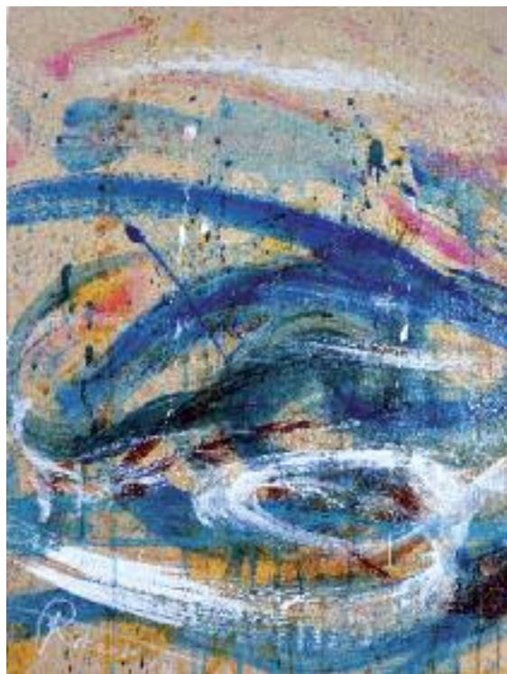
TEMPEST 22" by 30" // Acrylic on rag paper