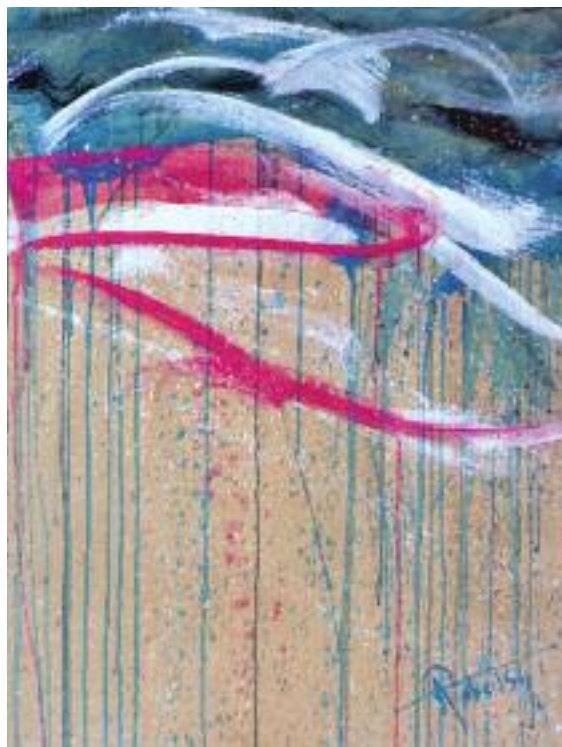
DRIZZLE 22" by 30" // Acrylic on rag paper