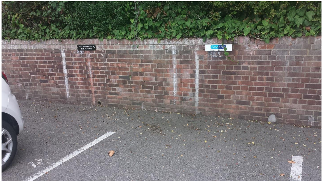
Figure 6: Mixed Parking where I Work, Each Parking Bay Clearly Marked.