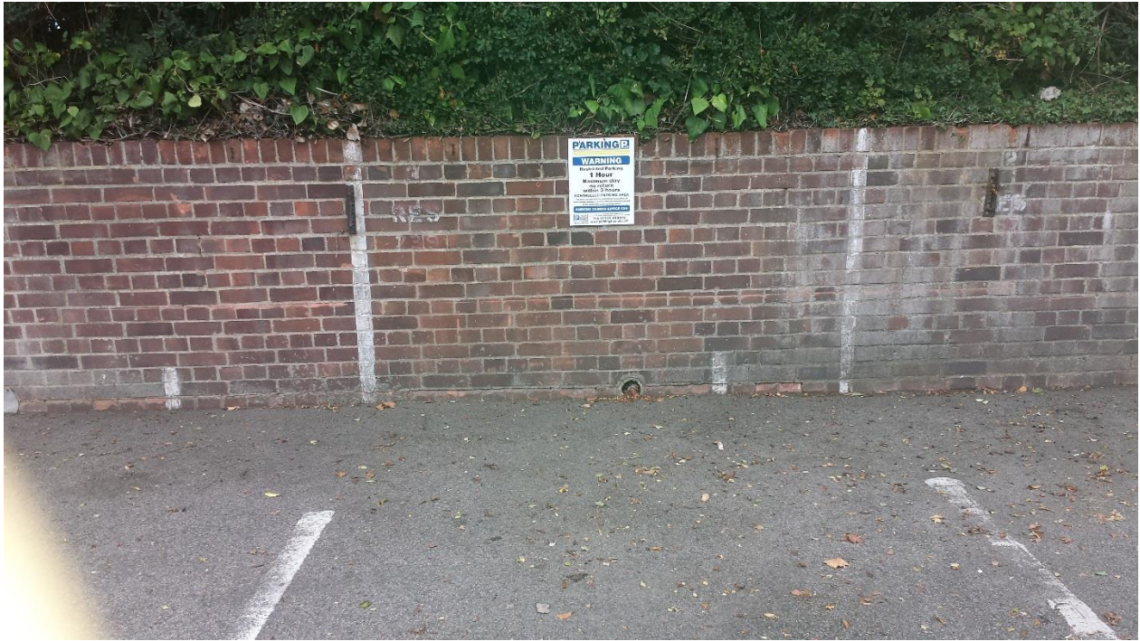
Figure 7: Mixed Parking where I Work, Each Parking Bay Clearly Marked.