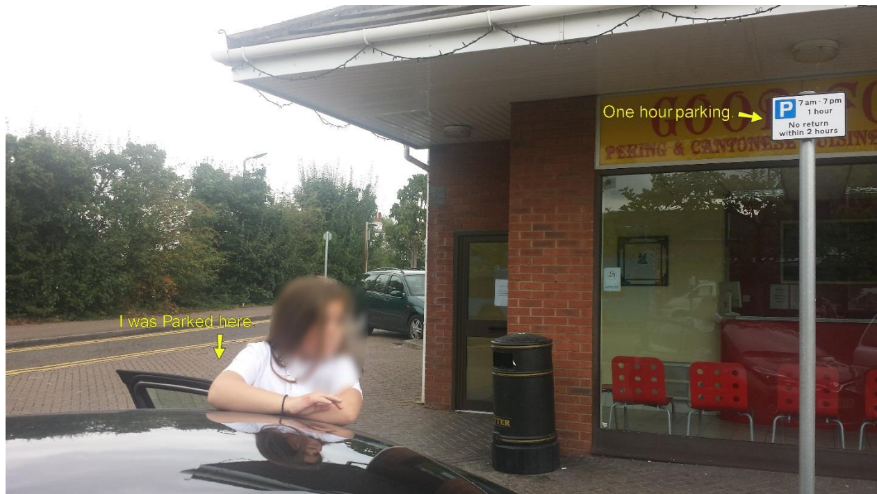
Figure 5: One hour parking Sign & What looks like Shop Parking.