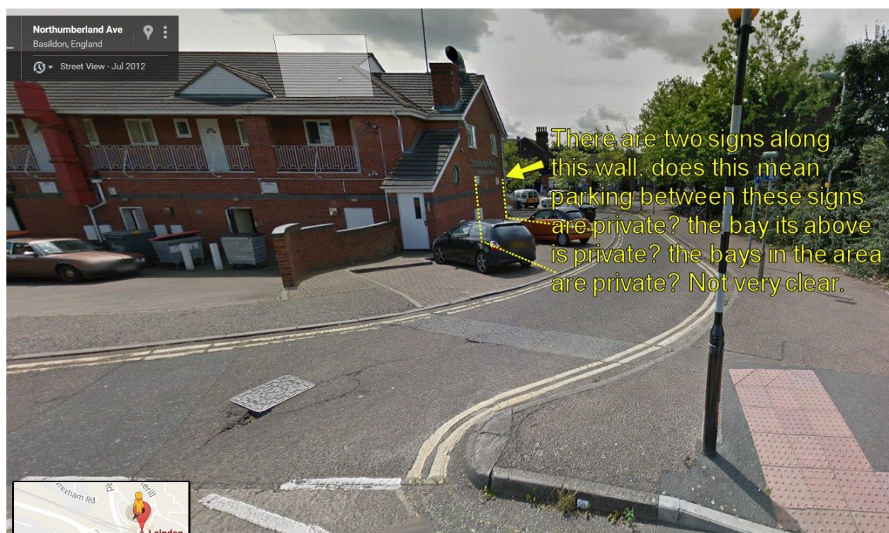
Figure 4: Unclear Signs.