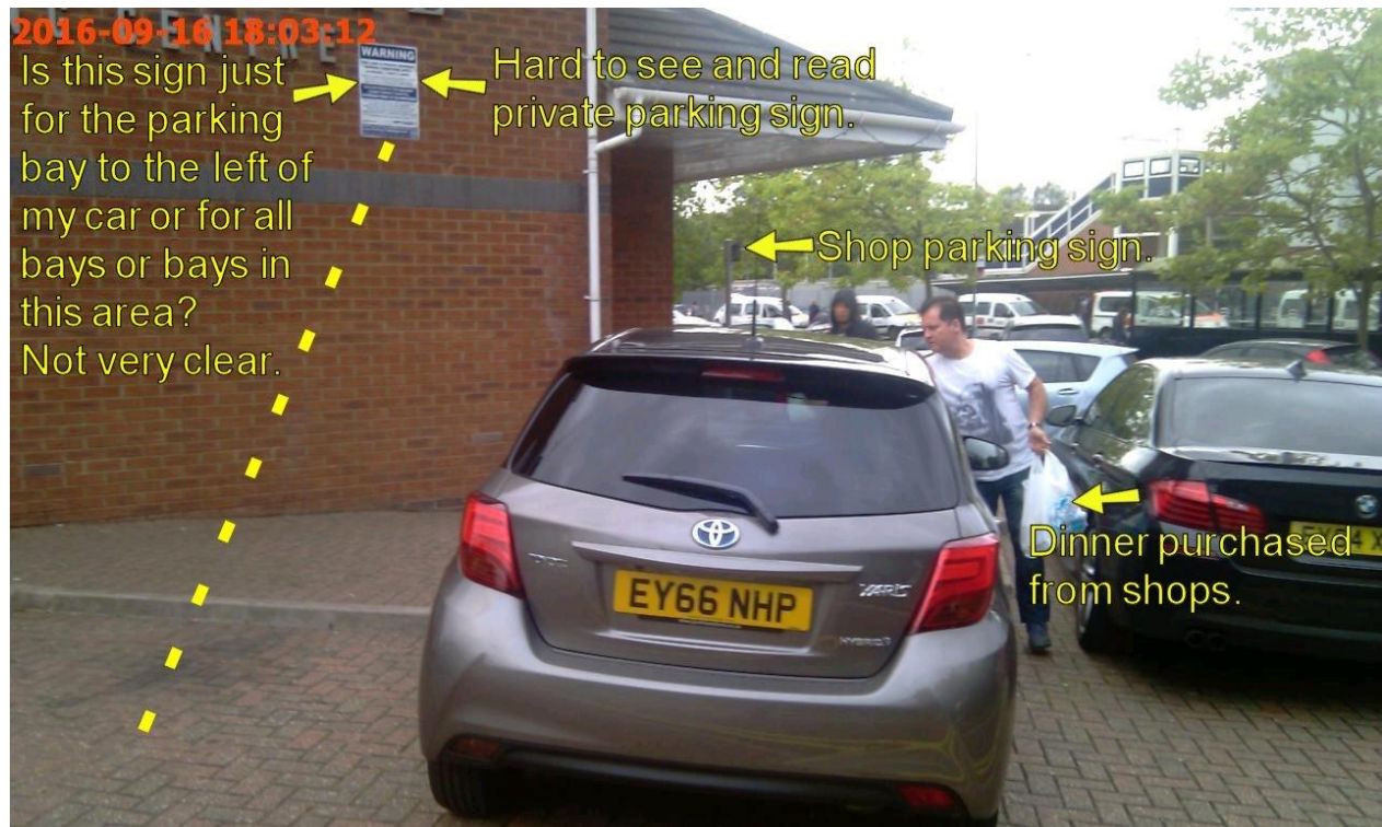
Figure 1: Picture from your Website, Shows Shops were Used and Unclear Signs.