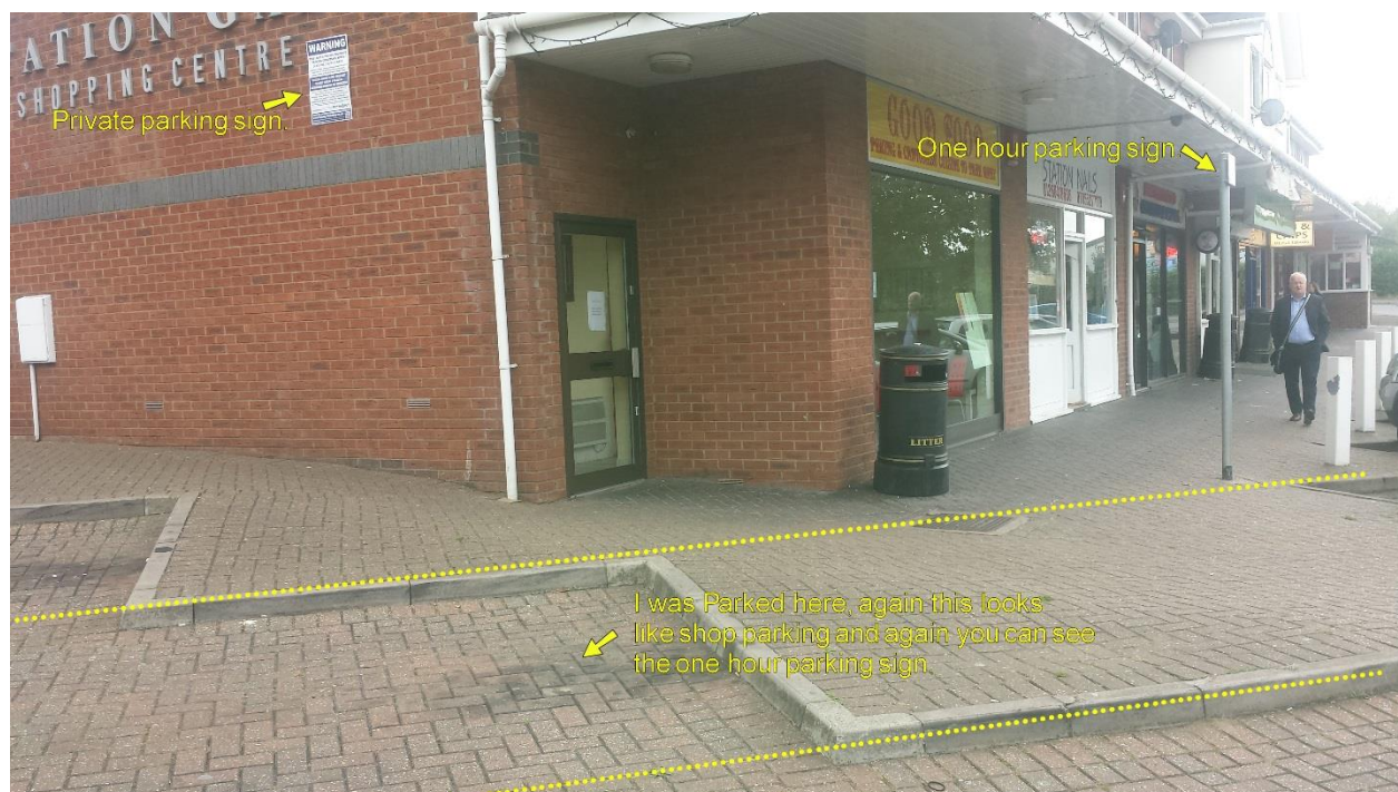
Figure 3: Unclear Signs and Parking Bays not marked.