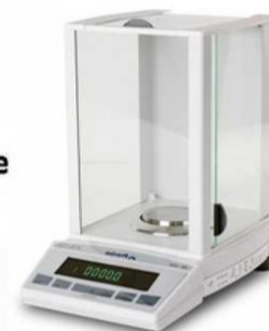
XB Series Balance