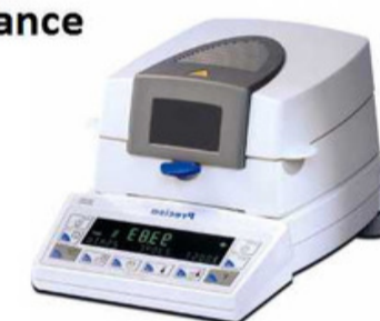
XM Series Moisture Balance