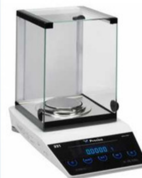
LX Series Balance