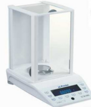
LS Series Balance