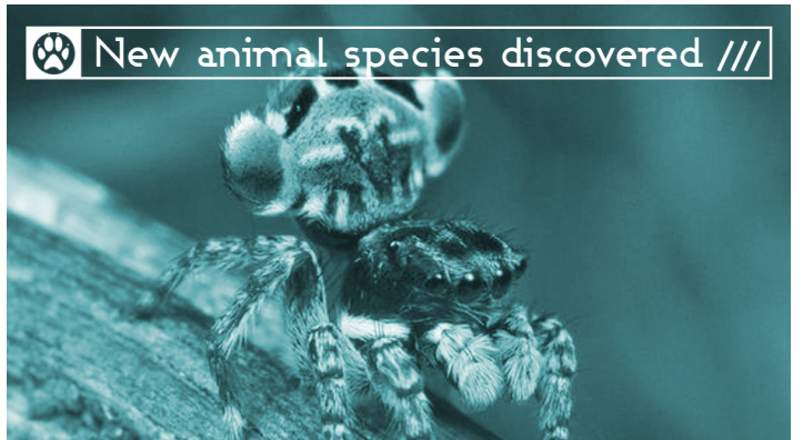
Márquez's tarantula, Colombia