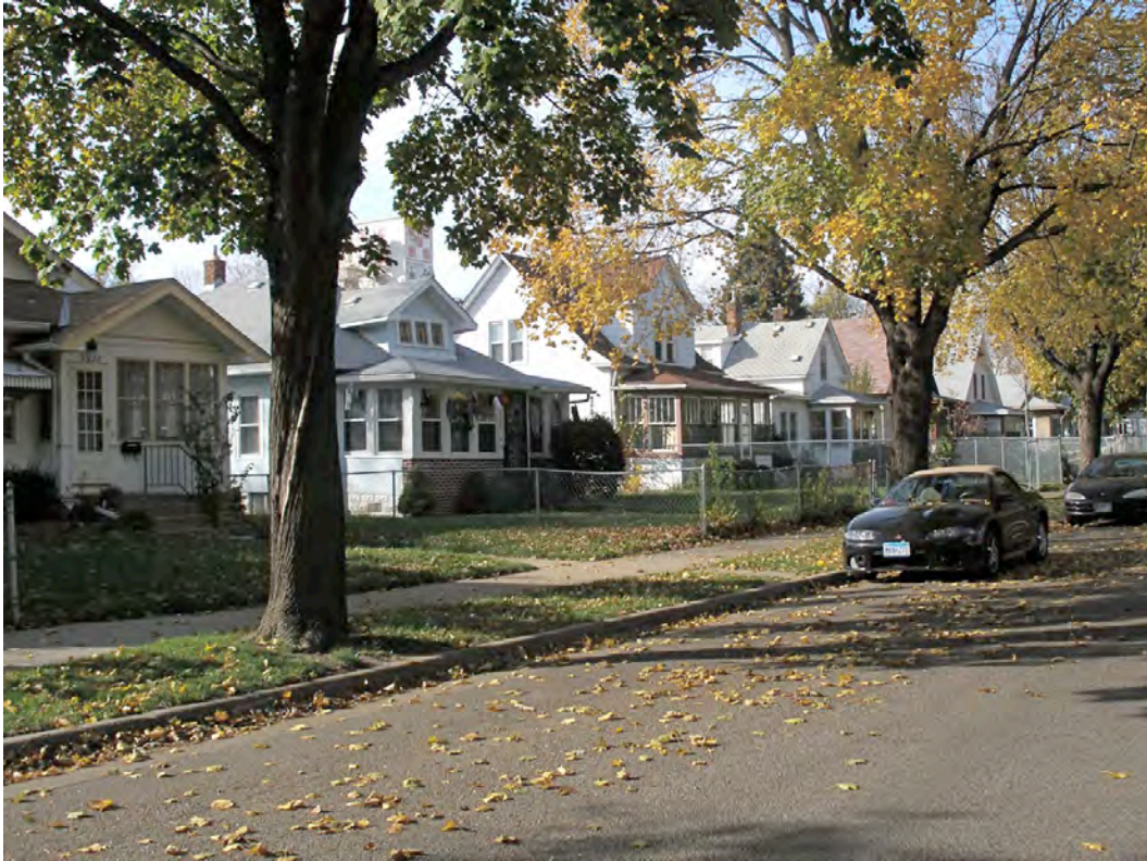
Typical houses and their grain-elevator backdrop: the 3900 block of Snelling Avenue, 2008.

Minneapolis' late 19th-century African American population was small in number; the 1870 census recorded only 160 individuals. 1 By 1900, the number rose to 2,592, reached 4,176 by 1930, and 4,646 in 1940. During this period "black people resided in every ward in the city, but the majority were . . . concentrated in the area of Nicollet Avenue and 10th Street." 2 The Seven Corners area near Washington and Cedar Avenues (much of which is now covered by I-35W and other development) comprised another settlement. The settlement concentration subsequently shifted toward north Minneapolis, into areas being vacated by Jews. 3