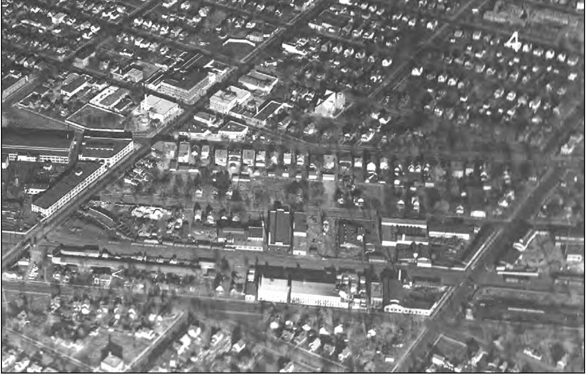
An east-facing aerial of the 3000 and 3100 blocks of Hiawatha, Snelling, and Minnehaha Avenues (1928) shows that single-family dwellings and industrial buildings and were mixed along the three streets.