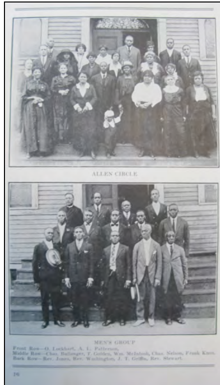
Historical Souvenir of St. James A.M.E. Church, Minneapolis, Minnesota (1926).