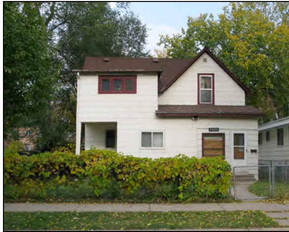
3655 Snelling Avenue (ca. 1902), in 2009.

In 1927, transience of the city's African Americans was studied, and it was observed that of 463 families in the study, 344 had lived in their present location less than five years. 24 During the first 20 years of African American occupancy on Snelling Avenue (1895-1915), this seems to have been the case, but between 1920 and 1930, a more permanent community appears to have developed. In 1920, for example, 8 of 14 households on the 3600 block of Snelling were owner-occupied. 25 The 1930 census recorded at least 25 African American households along the length of Snelling Avenue and at least three on adjacent Minnehaha Avenue. A total of 15 houses on Snelling Avenue were owner-occupied. 26 Like the Shingle Creek area in north Minneapolis, Snelling Avenue increasingly provided a place of permanence. 27