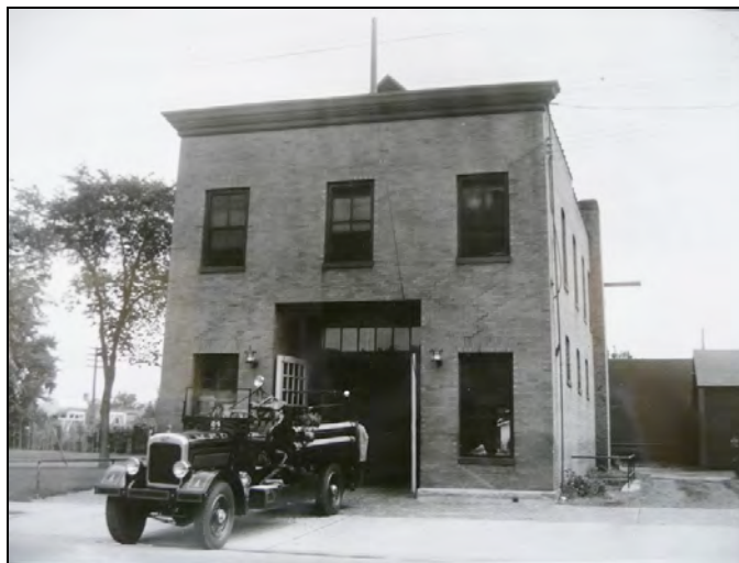
Fire Station #24 (1907), 4501 Hiawatha Avenue.

colored members of the force, who are credited with being first-rate men, to segregate them in one station.” They felt that the station should be a “berth for the older members of the force who would welcome a relief from the constant strain of downtown duty.” 10 A petition signed by 60 women, all area residents, supported the assignment of the black firemen to the station. 11