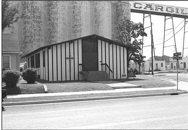
St. James AME Church, 3600 Snelling Avenue (1958), 1975.