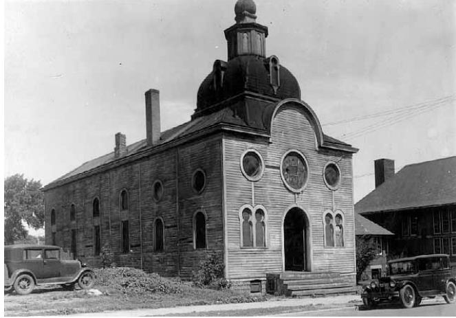
St. James A.M.E., 314 15th Ave. S., 1936