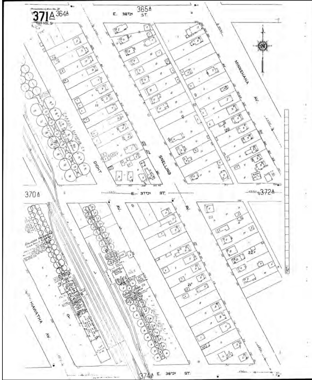
The 3600 and 3700 blocks of Snelling Avenue in 1952 (Sanborn Fire Insurance Co. Map). St. James AME had not yet been built at the southeast corner of E. 36th Street and Snelling Avenue.