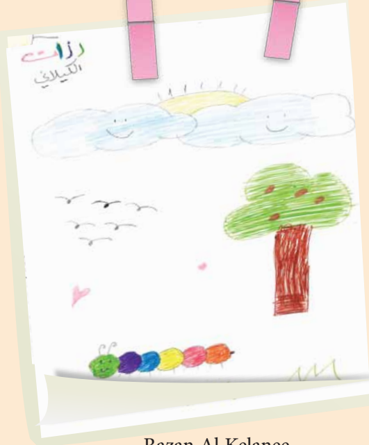
Razan Al Kelanee