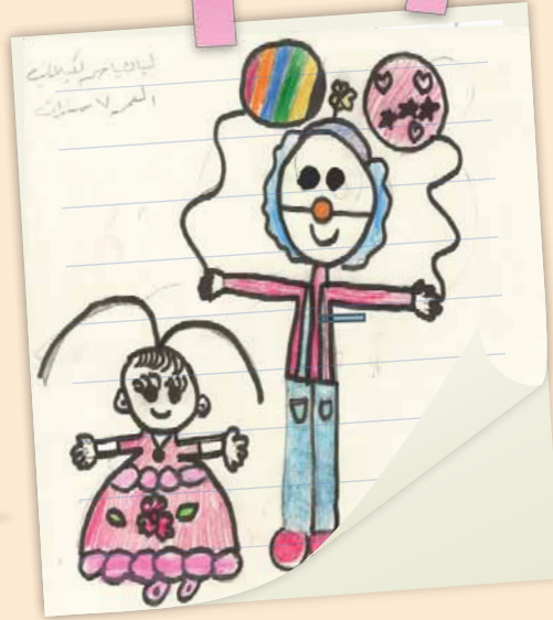
Layan Al Kelanee