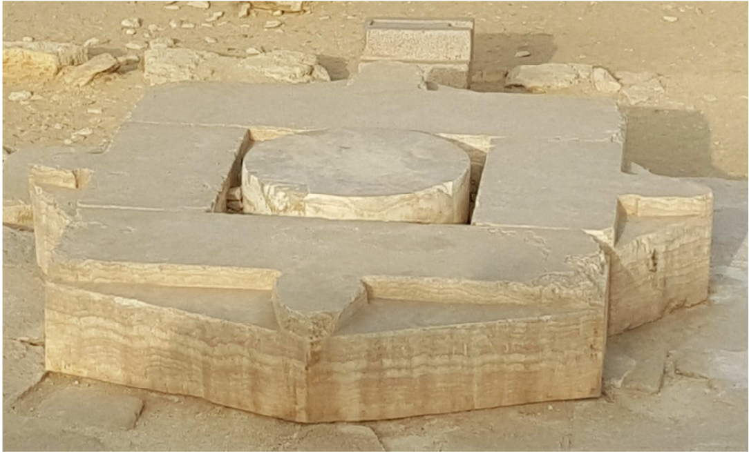
A unique structure is in front of the base, we call it Ra-Hotep, we didn't find any similar. This Ra-Hotep is made out from travertine "Alabaster", it is oriented to the 4 cardinal directions.