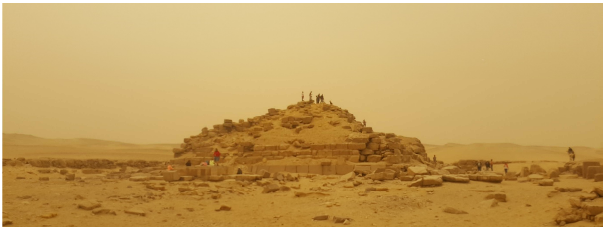
This is what is left from the base; the obelisk is no longer there