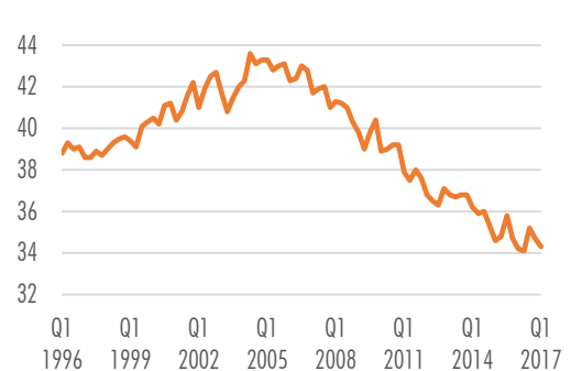
Figure 3: Homeownership Rates for Adults Under 35