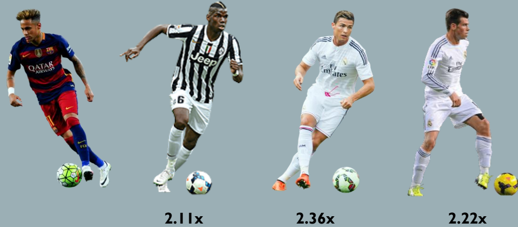
Record Transfer Fees in Millions of Euros

Transfer fees are not paid to players but rather clubs, and in Spain where buyout clauses are mandatory, these fees are payed to La Liga who oversee distribution to individual clubs